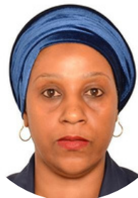
Hon. Judge Sehel Barke

Justice of Court of Appeal of Tanzania and chairperson of Tanzania Women Judges Association (TAWJA)