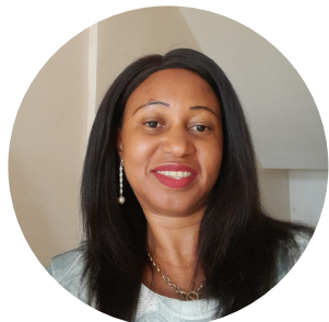
Hon. Judge Atila Ferreira