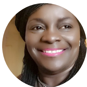
Hon. Judge Roli Harriman

Justice of Court of Appeal of Tanzania and chairperson of Tanzania Women Judges Association (TAWJA)