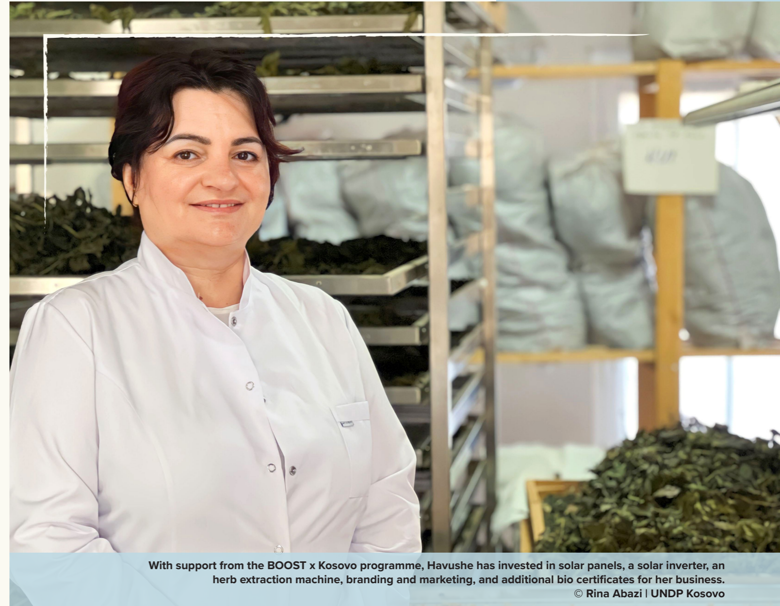
With support from the BOOST x Kosovo programme, Havushe has invested in solar panels, a solar inverter, an herb extraction machine, branding and marketing, and additional bio certificates for her business.

A partnership with the European Bank for Reconstruction and Development (EBRD) and Raiffeisen Bank Kosovo leveraged a further €165,000 in investment.