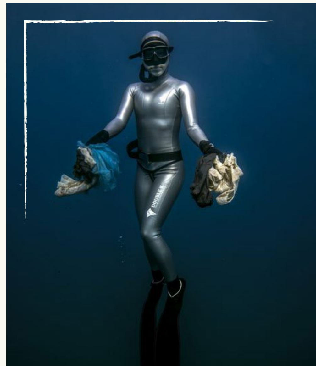
Şahika Ercümen, holder of the world record in free-diving and UNDP Türkiye's Life Below Water Advocate, is passionate about protecting marine ecosystems.

To address the growing threat of invasive alien species to the marine ecosystem, thereby making it more resistant to the negative impacts of climate change, the project has advanced several initiatives. The acquisition of an amphibious vehicle to enable mechanical control of the invasive water hyacinth, coupled with extensive training for four municipal staff on its use, has been a crucial step forward.