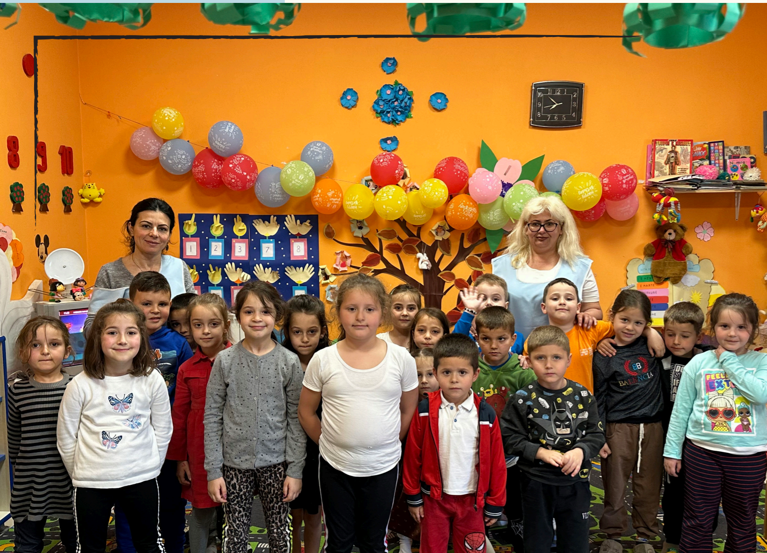
With the installation of solar panels, kindergartens in Ngjyrat and Ben Tusha can look forward to cozy warmth during winter and refreshing coolness during summer.

“ We are overjoyed that solar panels will be installed!”