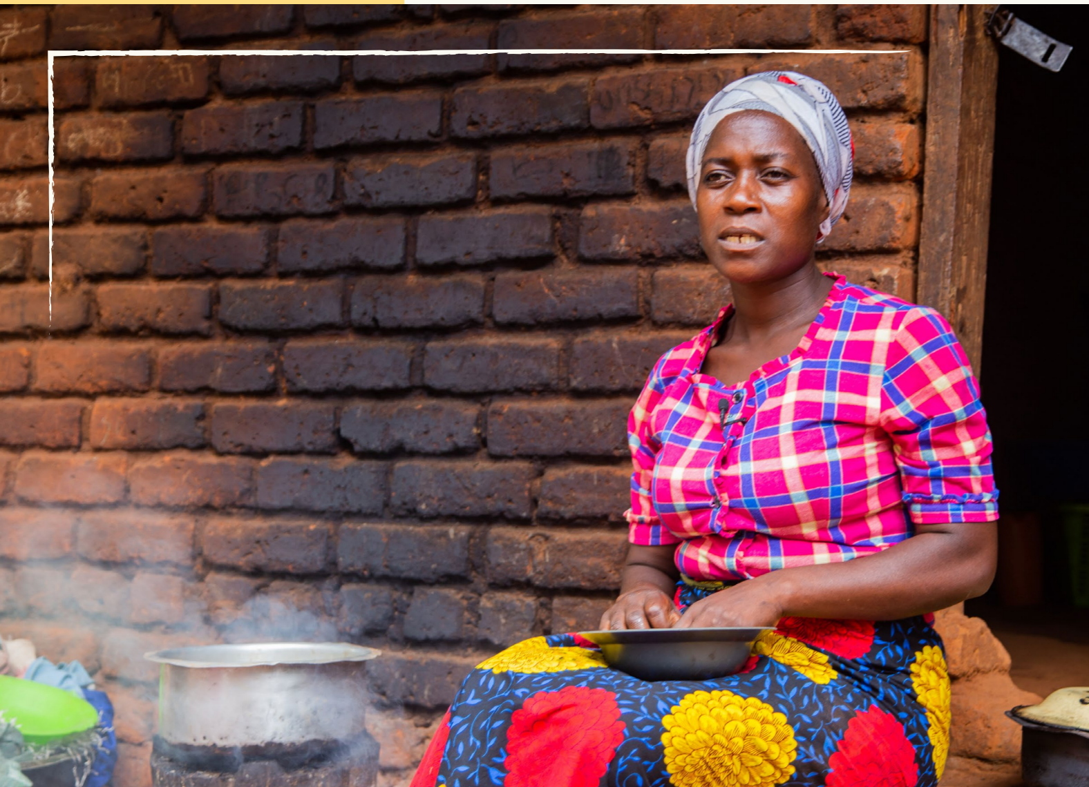
Approximately 90 percent of Malawi's population use firewood and charcoal for energy and cooking, with adverse consequences for their health, the environment, and the climate.

“ The new [energy-efficient] stove requires less time to prepare, and less money to run.”