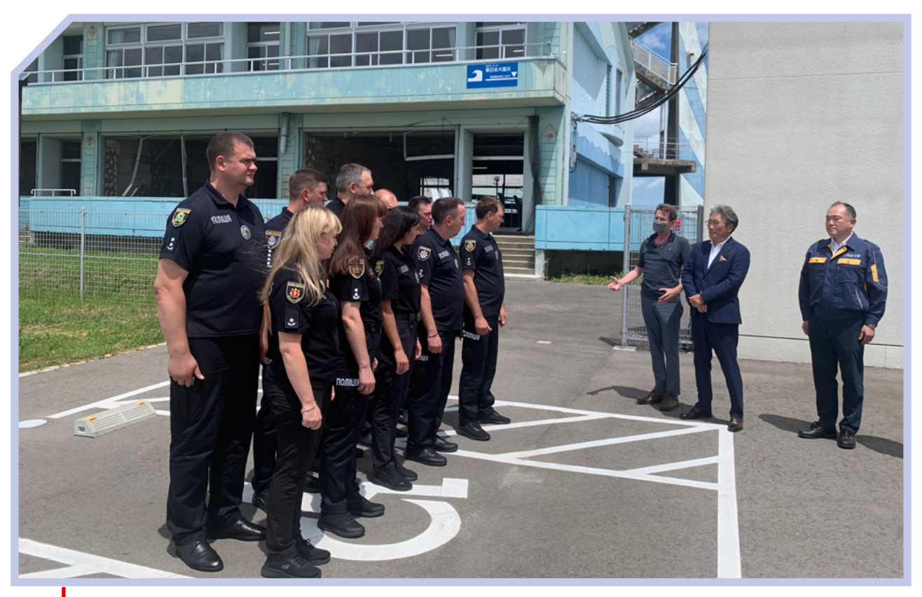
Ten forensic specialists from the National Police of Ukraine visited a school ruined in the Great East Japan Earthquake of 2011 in Fukushima Prefecture, Japan, in July 2023.

25 forensic experts from the Ukrainian National Police participated in the knowledge exchange study tour to Japan (Tokyo and Fukushima) to enhance their knowledge about forensic investigations of war-related crimes.