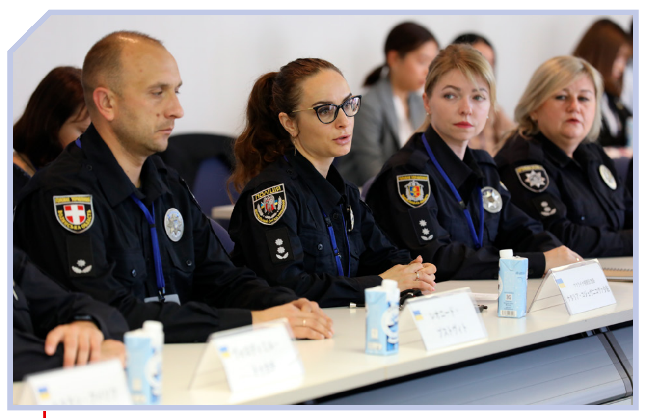
Fifteen delegates from the National Police of Ukraine and Ministry of Interior came to Japan in October 2023 to learn from experts of the National Police Agency of Japan about forensic techniques.