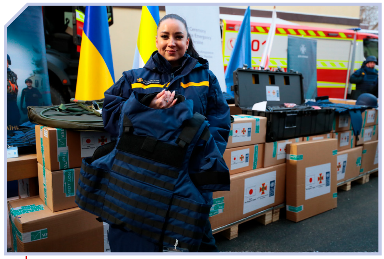
A worker of the State Emergency Service of Ukraine at a handover ceremony for demining and protective equipment, Kyiv – January 2023.

UNDP is bolstering the demining capacity of the State Emergency Service of Ukraine (SESU) and improving the safety of personnel by delivering requested equipment.