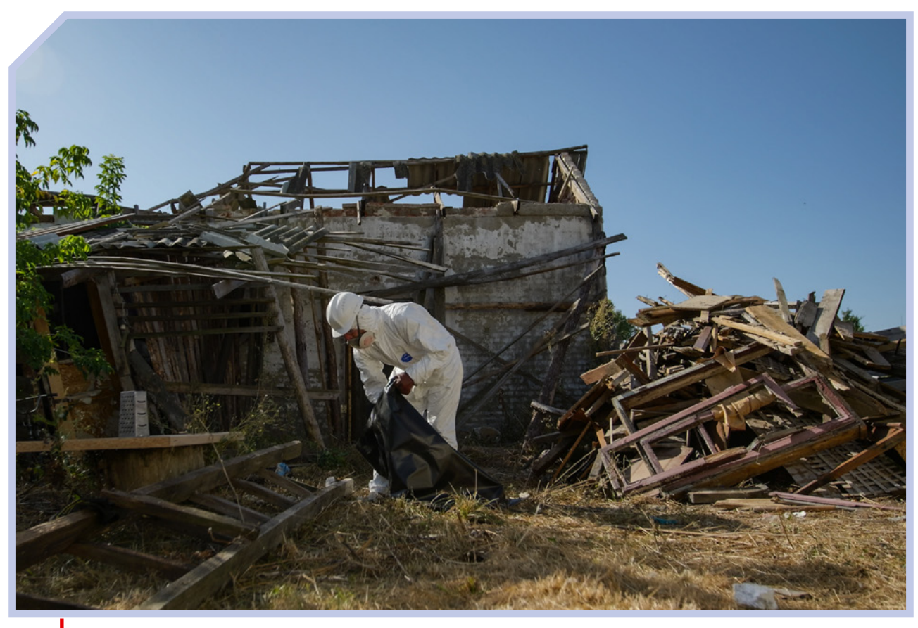
A debris removal worker in a specialized protective uniform collects asbestos-containing materials from the yard of a destroyed house, Kyiv Oblast – August 2023.

UNDP is supporting local authorities in establishing an effective debris management system, which consists of the following steps: