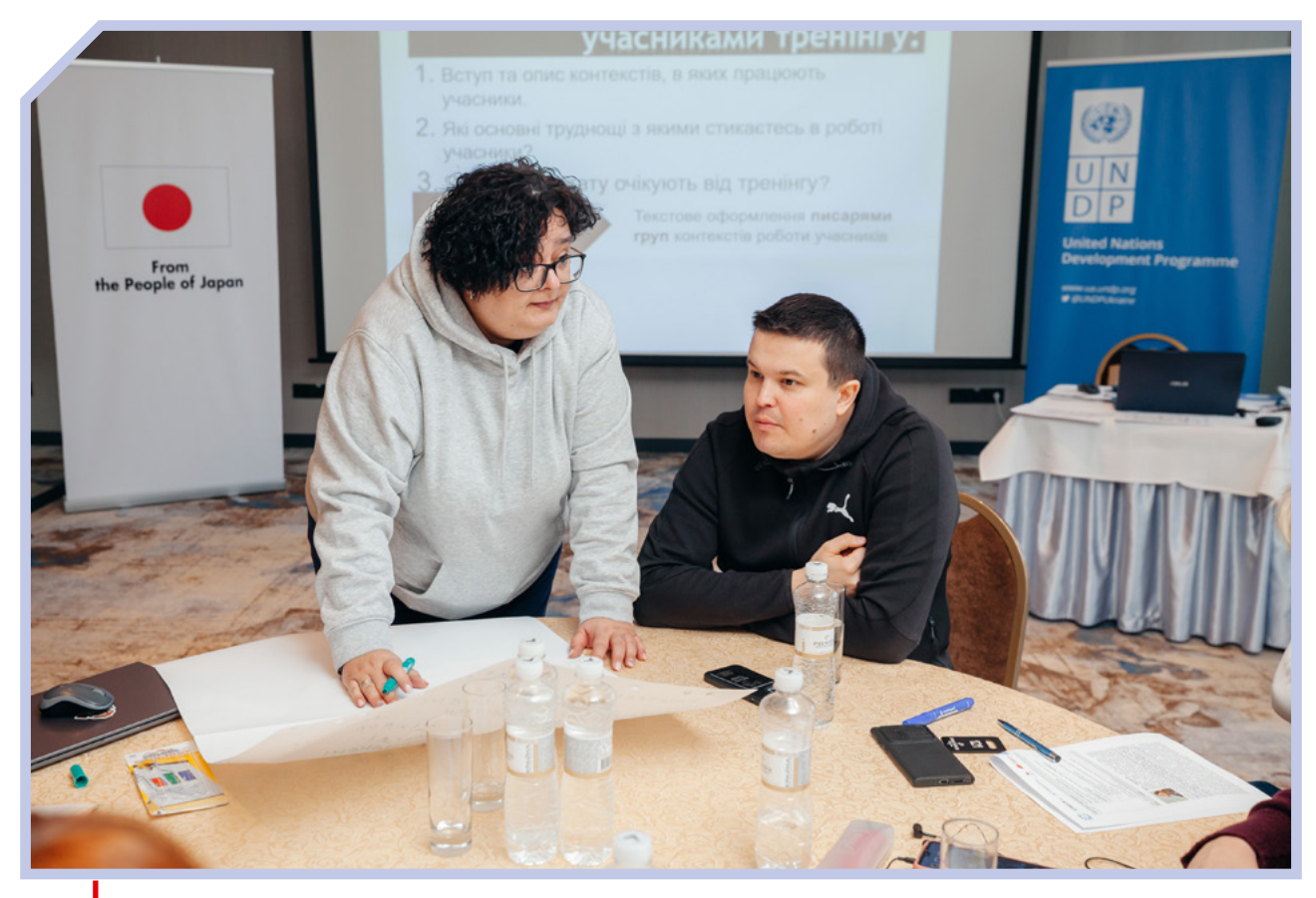
The first training session for members of the Ombudsperson's Secretariat and its regional network, on the psychological basics of communicating with people affected by war, with families and loved ones of prisoners of war, and of those killed in action, veterans, and people injured in hostilities – April, 2023.

UNDP is strengthening capacities of national and local actors to mainstream human rights and inclusive access to justice, prioritizing IDPs and vulnerable groups. The support encompasses training, equipment/software provision, and advocacy initiatives.