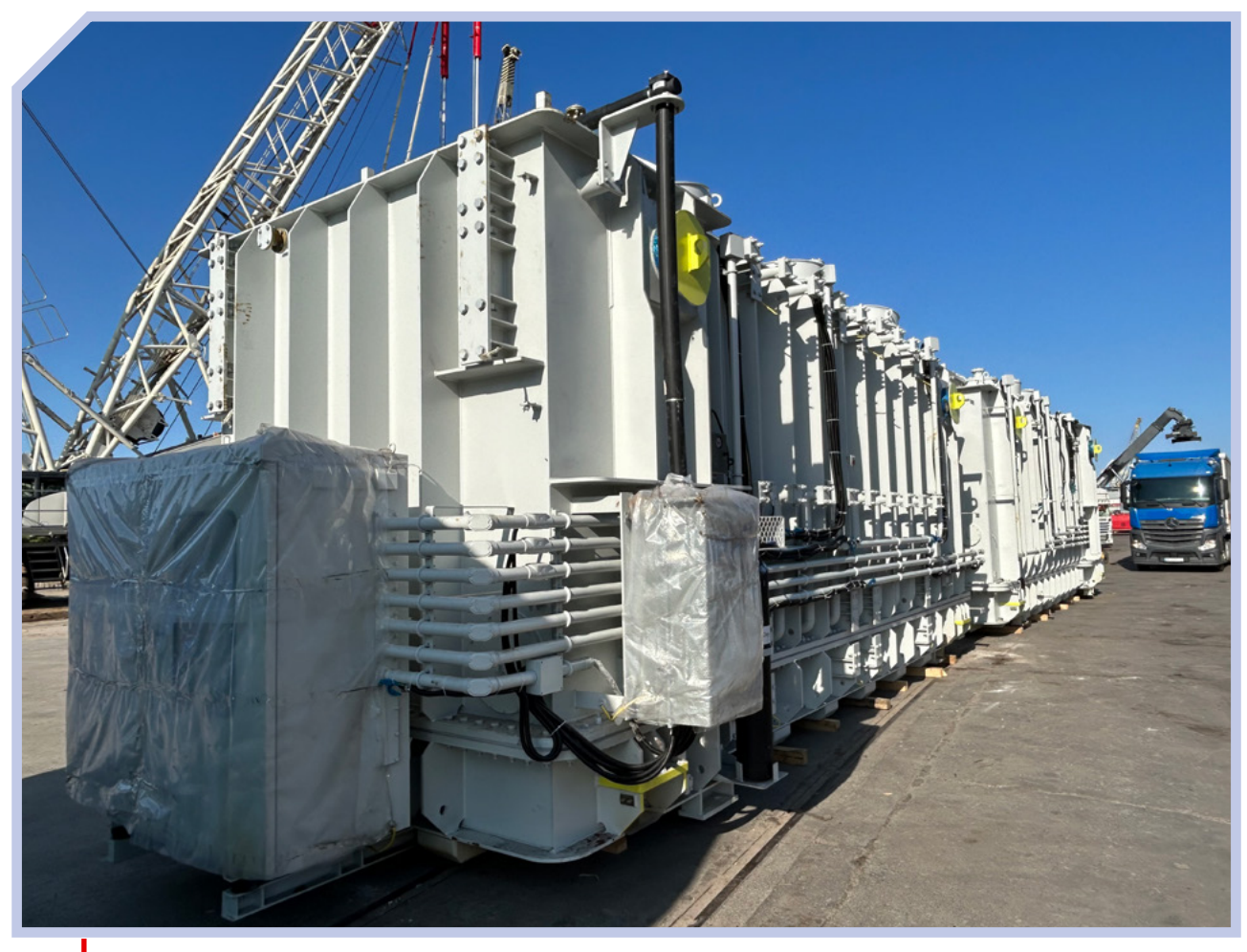
An autotransformer arriving in the port of Gdansk, Poland, on the way to Ukraine – September 2023.

UNDP has been supplying equipment and offering support to Ukraine's energy sector, fostering its transformative recovery, with a focus on: