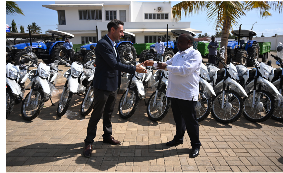
COMMUNITY SECURITY AND SOCIAL COHESION

Emphasis on socio-economic support through sustainable livelihood opportunities, acknowledging the importance of empowering citizens with viable economic avenues.