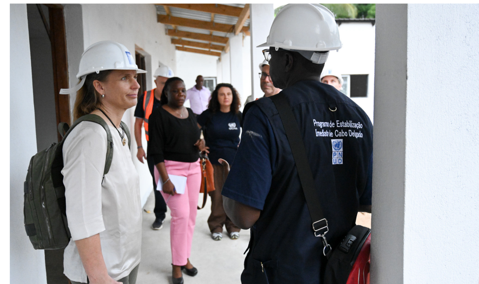
PUBLIC INFRASTRUCTURE AND ACCESS TO BASIC SERVICES