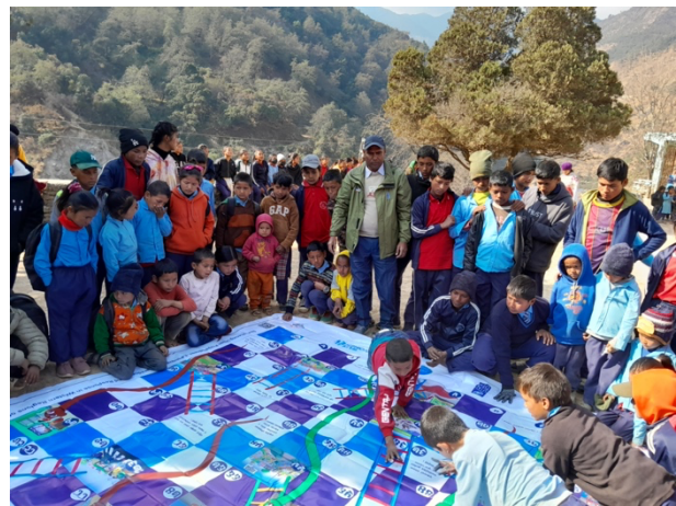
Earthquake Safety Day celebrations being observed in Barekot RM on 16 January 2024. The children are playing an informative game of snakes and ladders, learning about disaster preparedness.