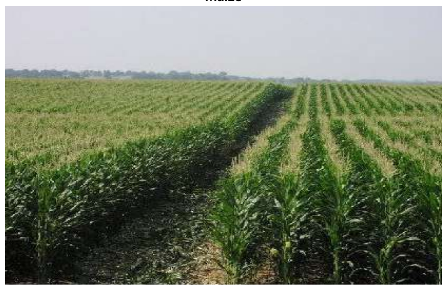
Songwe is one of the leading seven regions in the Southern Part of Tanzania Mainland in the production of food crops especially cereals (mainly rice and maize) and legumes as well as cash crops mainly coffee. The region is food selfsufficient and in the year 2018/2019, the region had an estimated reserve of more than 177,467 tonnes of maize.