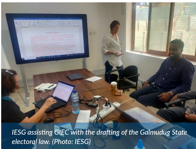
IESG assisting GIEC with the drafting of the Galmudug State electoral law.

During the reporting period, IESG worked with Commissioners and the Secretary-General from the GIEC to develop an operational outline to identify key actives and timeline for local elections in 2024. IESG also provided support for the drafting and review of two pieces of legislation, the electoral law and the political party law. IESG also provided inputs for the review of the Galmudug Constitution, specifically on harmonizing provisions on elections to the proportional representation system. The constitutional amendments and the electoral law were adopted by the Galmudug State Assembly in June 2023. IESG also supported GIEC in organizing consultations ahead of the adoption of the electoral law. Within the context of institution building of the GIEC, operational support was provided to set up GIEC office in Dhusamareb.