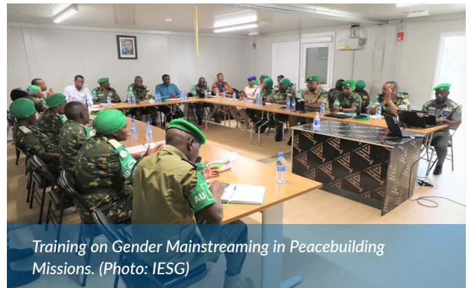
Training on Gender Mainstreaming in Peacebuilding Missions.

On 19 May, IESG Field Office in Kismayo, together with the UNSOM Head of Office, met the Jubaland Minister of Interior. During the meeting, the minister informed of the intention of reconstituting the Jubaland Independent Boundaries and Electoral Commission (JIBEC) will be reconstituted with new commissioners to boost confidence in the electoral process in Jubaland. The minister also shared details of a six-month plan to set up local councils in Jubaland, starting with Dhobley district followed by districts of Elwak and Badhaadhe.