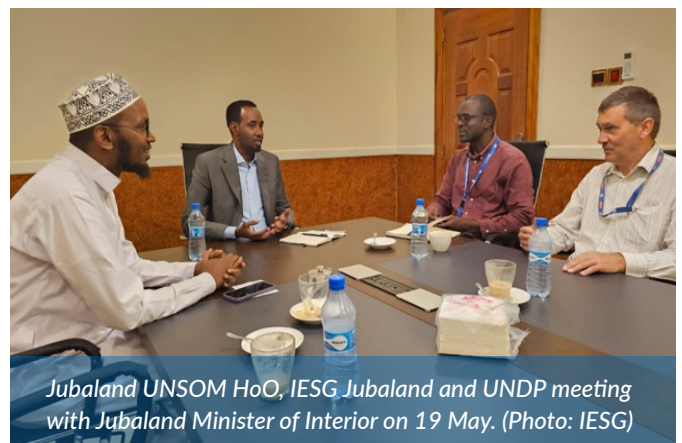
Jubaland UNSOM HoO, IESG Jubaland and UNDP meeting with Jubaland Minister of Interior on 19 May.

On 28 May, IESG Field Office, jointly with the UNSOM Integrated Gender Office held a virtual consultative meeting with Women Civil Society Organisations (CSOs) in Jubaland with the aim of providing an opportunity for the leaders to share their concerns and recommendations in enhancing CSOs' participation in politics and peace-building processes.