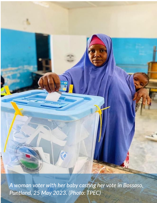
A woman voter with her baby casting her vote in Bossaso, Puntland, 25 May 2023.

In line with the provision of article 114 of the Puntland Constitution and with the Complaint and Dispute Resolution Procedure (2021), on 22 May, the TPEC appointed seven members, two women, and five men, to the Electoral Dispute Resolution Committee (EDRC). The EDRC received five official complaints: one of these complaints was resolved by EDRC through its procedure. The four remaining complaints from Midnimo Women’s Association and three candidates were not acted on by EDRC as TPEC had already announced the election result. EDRC advised that these four remaining complaints should be filed with the Supreme Court, as results were already announced by TPEC. None of the complaints resulted in changes of electoral results.