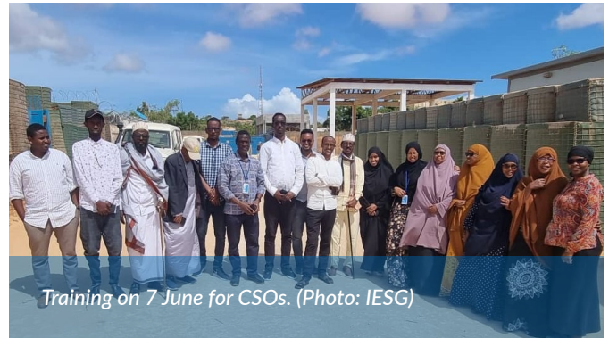
Training on 7 June for CSOs.

On 7 June , during a UNSOM Political Affairs and Mediation Group workshop for CSOs in Jubaland on peacebuilding, conflict prevention, and conflict resolution. The IESG Field Office made a presentation on “Sources of Election violence and mitigating measures with emphasis on the role of CSOs in contributing to the credibility of electoral processes”.