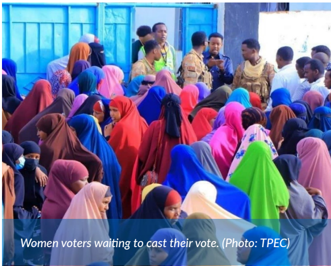
Women voters waiting to cast their vote.

Within the context of the support that IESG provides to the Galmudug electoral process, the team assisted Galmudug authorities with the drafting of provisions for 30 per cent quota included in the Galmudug regional state electoral law. As mentioned earlier, the law was passed by the Galmudug state assembly in June 2023. IESG also assisted with the review of the Galmudug political party law. The drafted amended law, which is currently being reviewed by the Cabinet of Ministers, includes new provisions for women representations in the executive bodies of political parties.