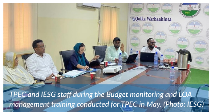
TPEC and IESG staff during the Budget monitoring and LOA management training conducted for TPEC in May.

During April to June 2023, IESG continued supporting TPEC with the administration of the Letter of Agreement (LOA). This included payments for the training of polling staff and procurement of polling material. The United Nations, through the Somalia Joint Fund (SJF) mechanism, filled the Joint Electoral Support Programme budget gap of 1.5 Million. In parallel, IESG also supported GIEC in the implementation of its LOA and provided direct financial support for trainings and consultations.