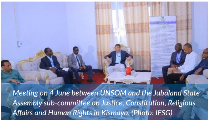
Meeting on 4 June between UNSOM and the Jubaland State Assembly sub-committee on Justice, Constitution, Religious Affairs and Human Rights in Kismayo.

On 4 June , in the framework of UN electoral assistance, UNSOM Field Office including IESG held a meeting with the Jubaland State Assembly sub-committee on Justice, Constitution, Religious Affairs, and Human Rights in Kismayo. The chairperson of the committee informed that Jubaland does not have a Ministry of Constitution but requested for support from UNSOM in the areas of training for the women members of parliament, in the establishment of woman caucus and advocacy for more women as commissioners to the electoral commission and more women candidates to be part of the decision-making process.