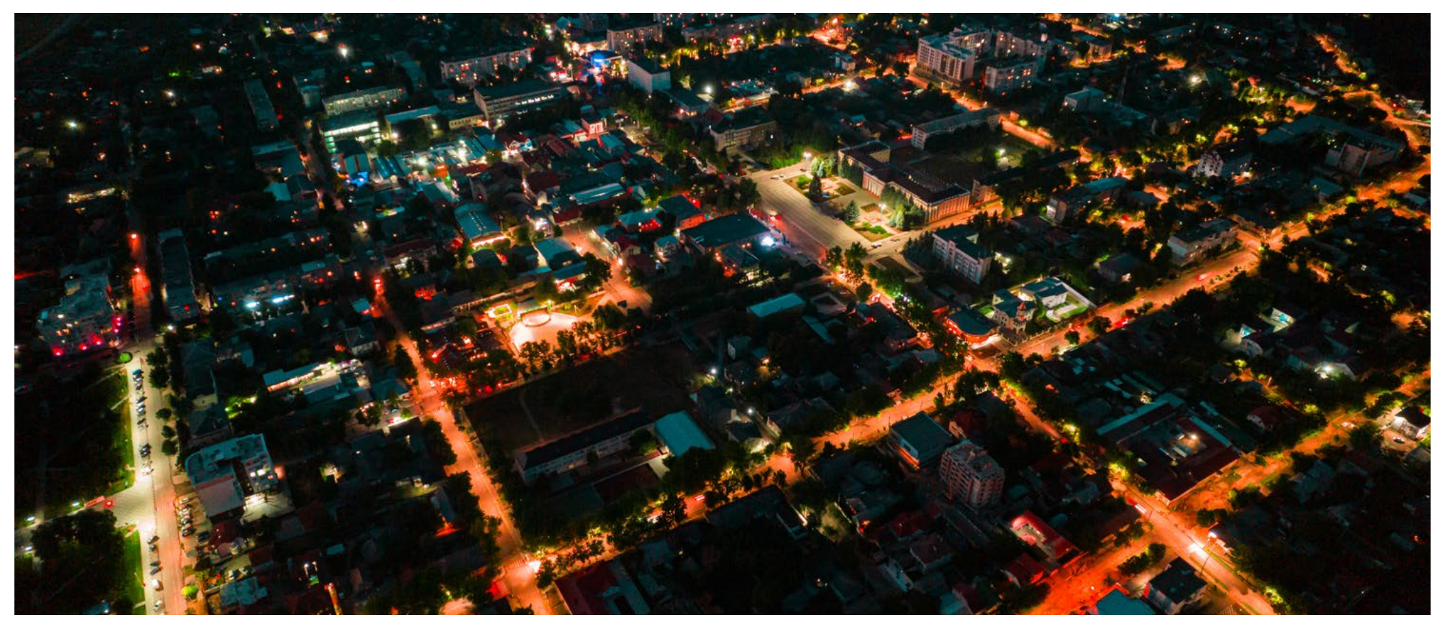
Street lighting involved the installation of 926 lighting installations, classified into different classes of the lighting system: with dimming and remote control (838 lighting installations) and without dimming and remote control (88 lighting installations).