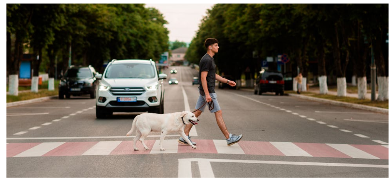
Naţională Street - paved, illuminated and with resistant road markings.