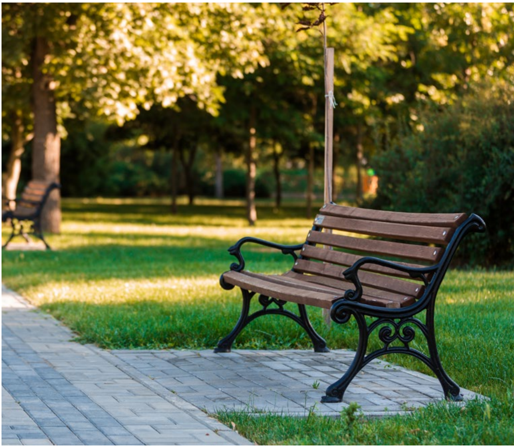
The rehabilitation of "Grigore Vieru" Central Park was a priority determined by the citizens of the municipality and the local public administration.