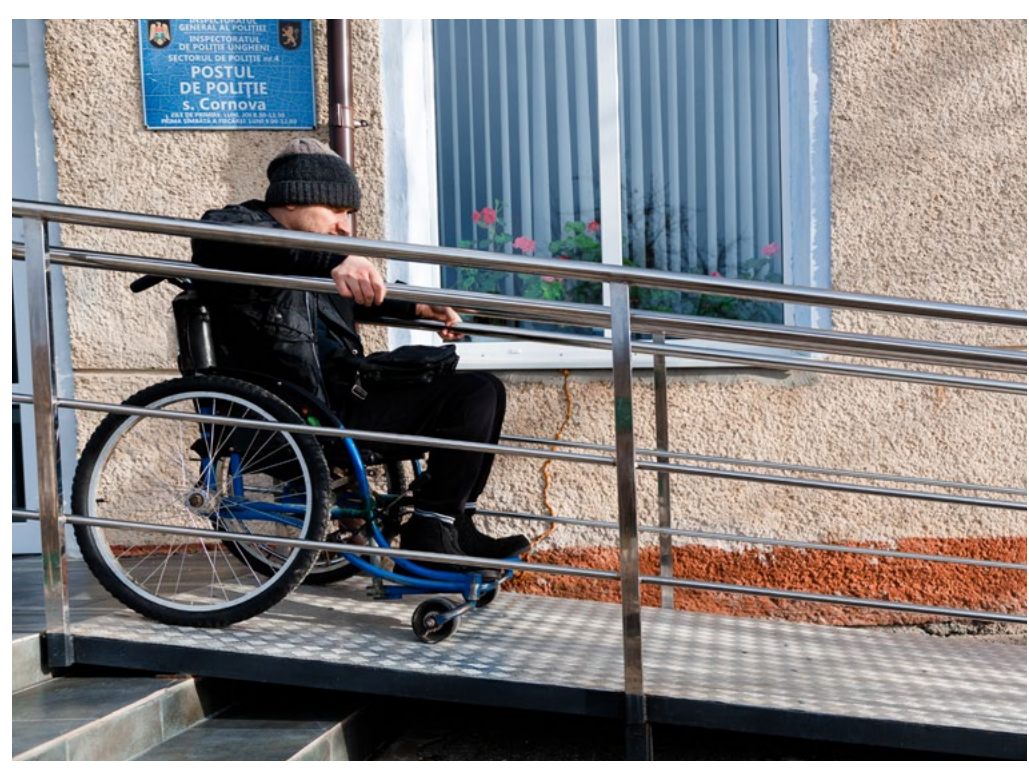
Access ramp installed at Cornova Mayoralty building, Cula sub-region, Ungheni district.