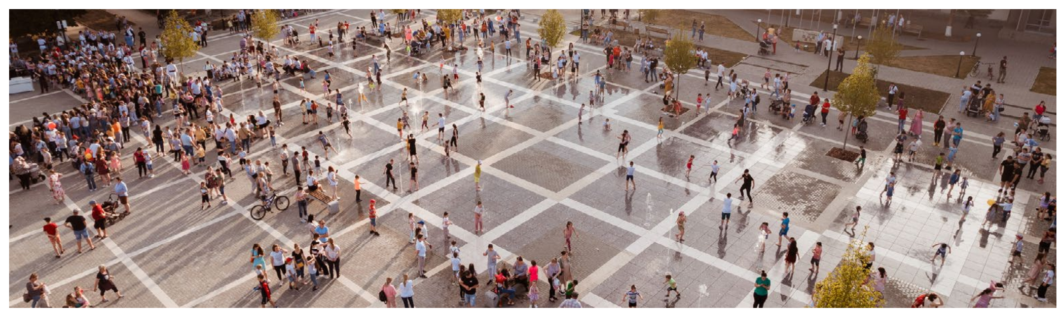
The Independence Square in Ungheni municipality has become pedestrian; street furniture was installed and a dry-type music pavilion with light and music show was built.

The revitalisation of the urban centre increases the attractiveness of Ungheni as a town - a "pillar of growth."