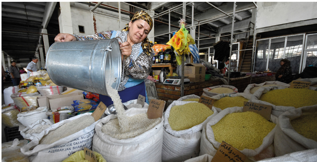
16 August 2016, Hissar, Tajikistan – FAO project enhanced government's capacities in Agrarian Reform and support the development of the agriculture and rural sector in Tajikistan.

The City Region Food System Toolkit 75 , for instance, highlights several steps, covering: an initial scan of secondary data and stakeholder interviews or focus groups for an identification of priority issues, as well as gaps for further research with primary data collection. This is followed by additional data collection and research and may involve the re-interpretation of secondary data. Well-designed data display is then developed in order to share the results of the assessment phase and prepare multi-stakeholder action planning.