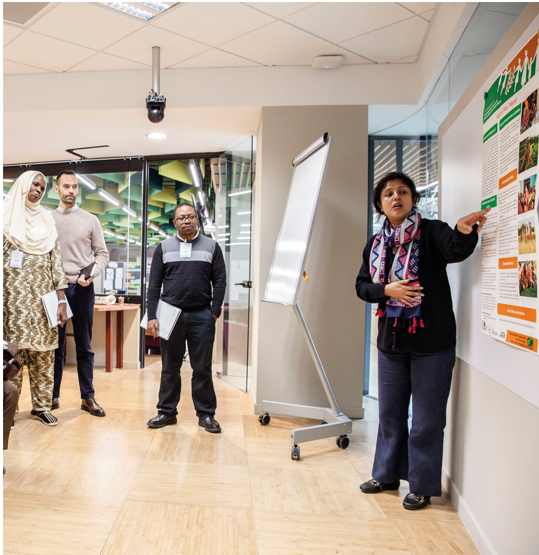
23 February 2017, Rome Italy - Workshop: Accelerating progress towards the economic empowerment of rural women with 7 country coordinators from the UN Joint Programme (FAO, IFAD, WFP and UN Women), FAO headquarters (Iraq Room).