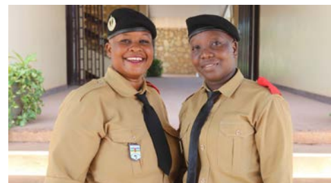
Magistrate students at the National School of Administration and Magistracy in the Central African Republic.

The evaluation of UNDP's support to access to justice , conducted by the Independent Evaluation Office in 2022, acknowledged UNDP's role as a key provider of international development assistance in the justice sector. UNDP is committed to operationalizing the recommendations and learning derived from the evaluation process, including further promoting a people-centred approach to justice.