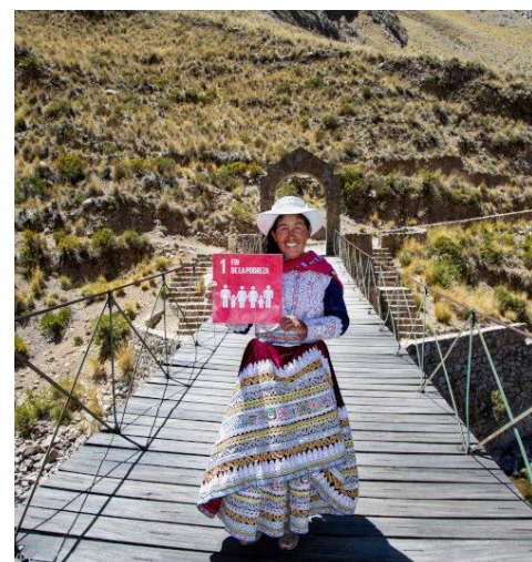
"Prosper under the sun."

TPP partners developed a framework for supporting NHRIs globally in 2023-2024.