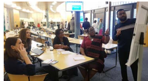
A Workshop on Advancing Access to Justice and Legal Aid in Situations of Forced Displacement convened by UNDP and UNHCR.

The Global Programme led and/or supported over 50 knowledge and learning-focused mechanisms (e.g. workshops, trainings, communities of practice, etc.) at global, regional and country levels with the primary aim of improving programme quality and effectiveness, as well as contributing to over 70 UN and non-UN policy discussions and events.