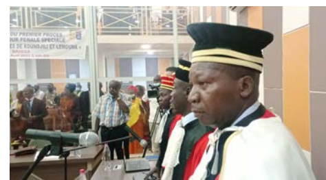
In the Central African Republic, fighting impunity is the priority of the Joint Rule of Law Programme. The Special Criminal Court delivered its first verdict in 2022.

In 2022, GFP delivered catalytic funding and technical expertise to joint rule of law programming in the Central African Republic, the Democratic Republic of the Congo, Haiti, Libya, Mali, Niger, Somalia and Sudan.