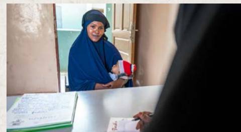
A woman reports a crime at the UNDP-supported police station in Qardho, Puntland, Somalia.

UNDP Seoul Policy Center (USPC), in coordination with UNDP's Rule of Law, Security and Human Rights team, supported partner countries in their combat against gender-based violence. The rights-based support mechanism for survivors and the relevant police capacity building programme of the Republic of Korea was shared with 7 countries in partnership with the Korean National Police Agency (KNPA) and Sunflower Center , Korea's one-stop service mechanism which provides counselling, psychological, medical, investigation and legal support to GBV survivors.