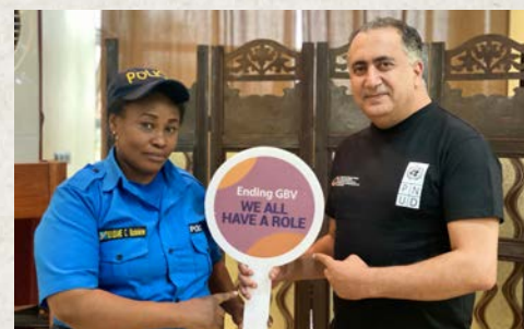
Field workshop for capacity building for GBV Legal Evidence Collection and Police within GBV multi-sectoral support setting, South Kivu Province, the Democratic Republic of the Congo.