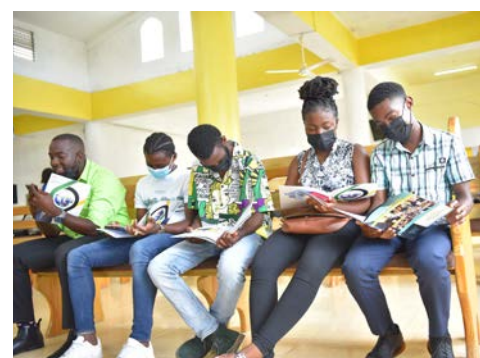
Youth from the Denham Town Community attending the launch of the SALIENT Joint Programme