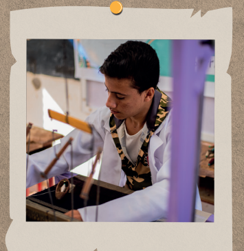
31 Village Saving