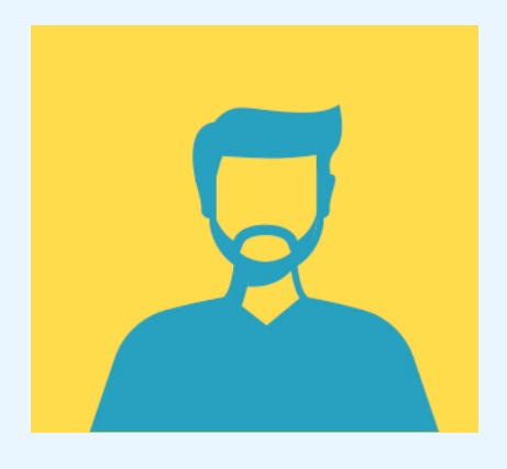
"STEMbek" (male roles)

Participants compared the public perception shaped by the gender stereotypes.