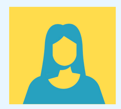
"STEMgul" (female roles)

In the STEM design thinking workshop, participants draw the portraits of