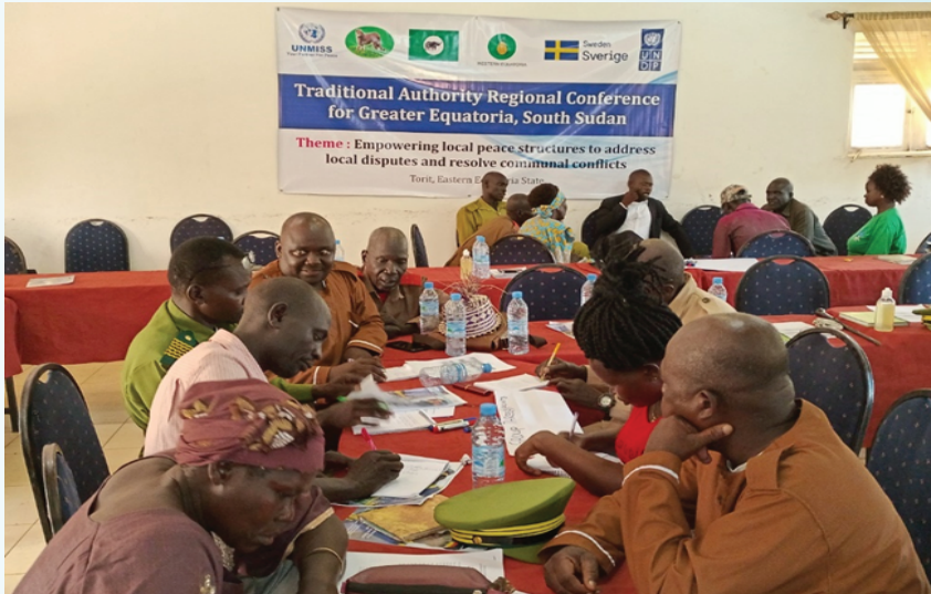
Traditional leaders having plenary discussions during the Greater Equatoria Leadership Conference.

Traditional leaders command a lot of respect and influence that can be used to engender positive behavioral changes in their respective communities. Their power and influence can be applied to foster peacebuilding and amicable resolution of conflicts.