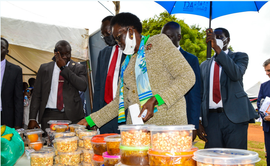
Vice President Rebecca Nyandeng de Mabior purchasing products from a vendor at the Jobs and Opportunities fair.

“ The Job Fair provided a platform for the exchange of information between job seekers and potential employers in one single place, which benefitted both sides by significantly reducing the cost for both job search and recruitment. ”