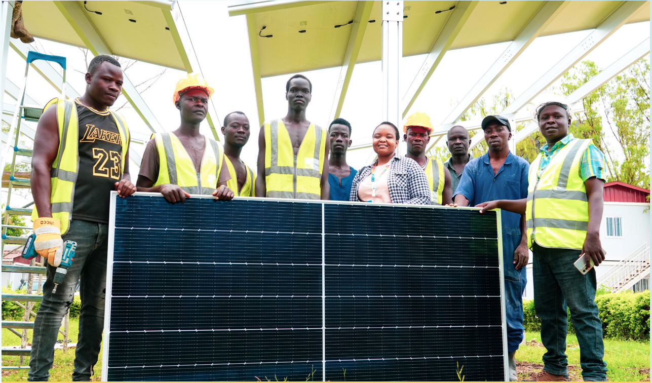
UNDP contractors pose for a photo during installation of Photovoltaic (PV) solar panels at the National Public Health Laboratory in Juba.

With an acute shortage of power supply, South Sudan is one of the world's least electrified countries. Solar power can turn this around by providing solutions and opportunities to drive the young nation toward sustainability. Renewable energy costs have dropped significantly in recent years; solar power has the potential to unlock numerous near-term and longer-term benefits in crucial sectors like public service, education, and health care in South Sudan. UNDP's solar power project seeks to leverage the advantages that solar energy brings to the energy sector in South Sudan to drive sustainable development.