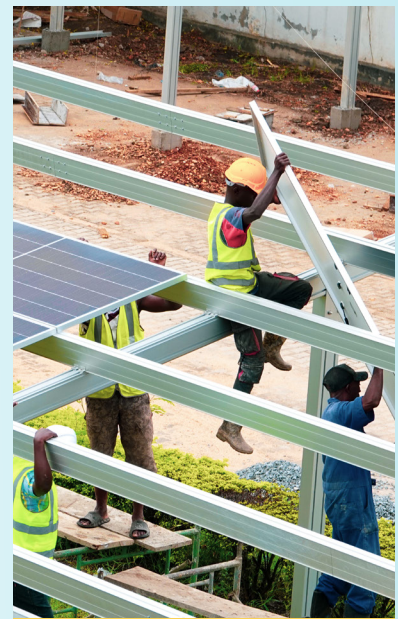
Contractors installing solar panels at the public health laboratory - in Juba.

Currently, the solar systems project aims to ensure access to affordable, reliable, sustainable, and modern energy for 27 health facilities in South Sudan (18 Hospitals, including the main referral hospital of the country, 5 primary health centers, two laboratories, 1 warehouse and the ministry of health.)