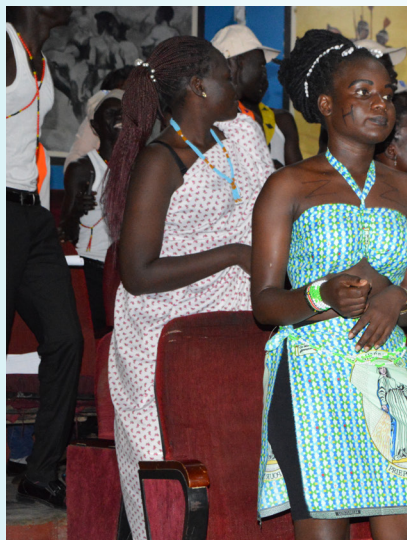
Traditional dancers from various ethnic communities performing at the peace day event.

“End Ethnic Discrimination, Build Peace in Diversity.”