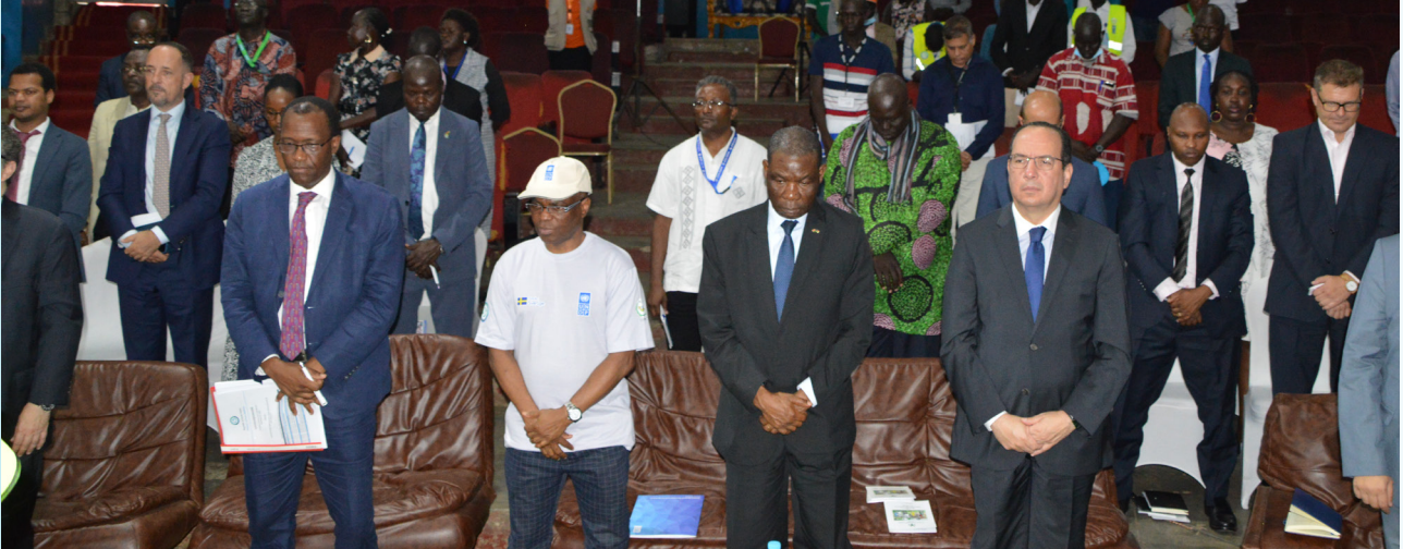
Titus Osundina – UNDP Deputy Resident Representative, Head of UNMISS - Political Affairs, Heads of other UN Agencies, Members of the Diplomatic Corps, Development Partners and Ministers from the National Government observing a moment of silence during the International Peace Day in Juba.

On September 21, UNDP joined the Government of South Sudan and other development partners in commemorating the International Day of Peace.