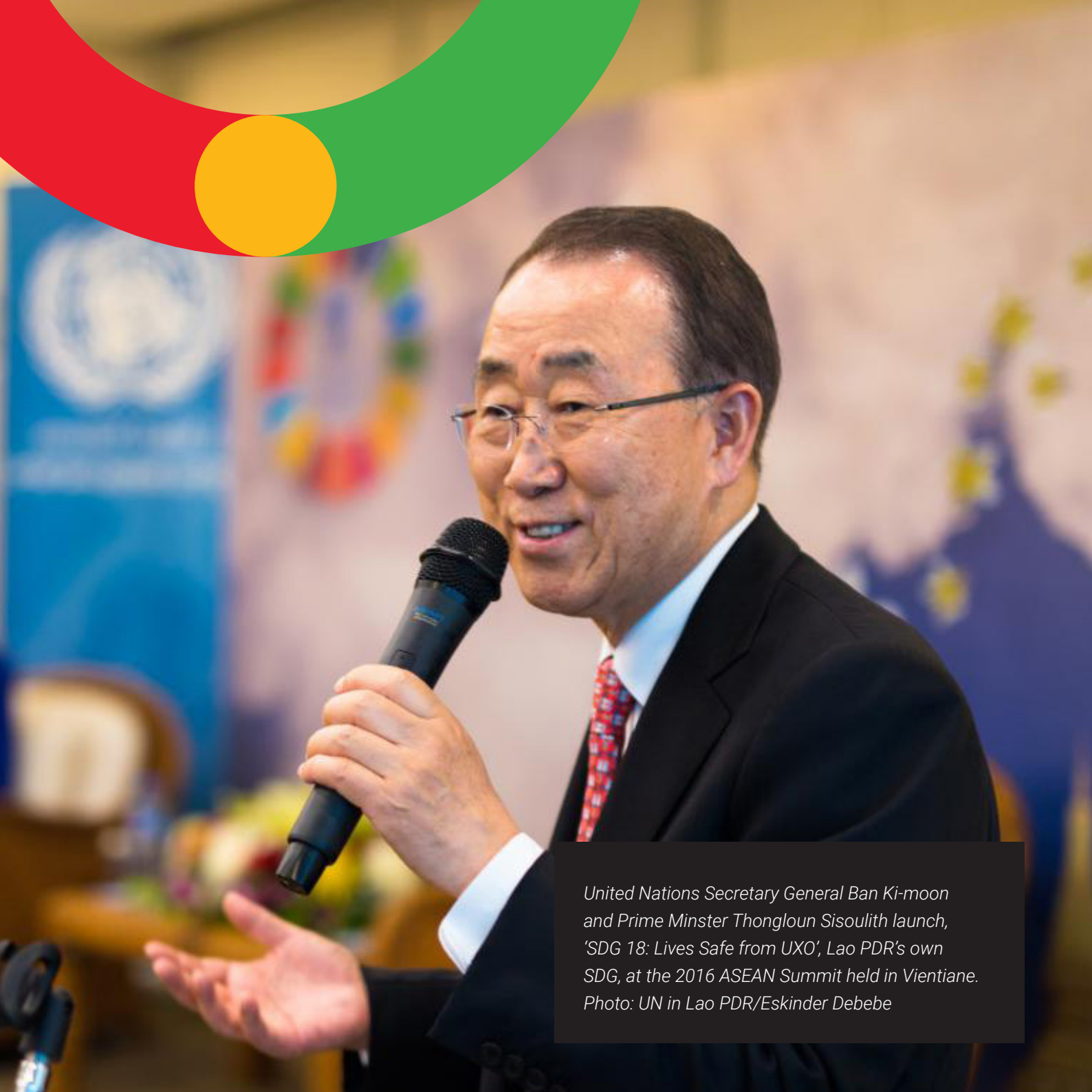
United Nations Secretary General Ban Ki-moon and Prime Minister Thongloun Sisoulith launch, 'SDG 18: Lives Safe from UXO', Lao PDR's own SDG, at the 2016 ASEAN Summit held in Vientiane.