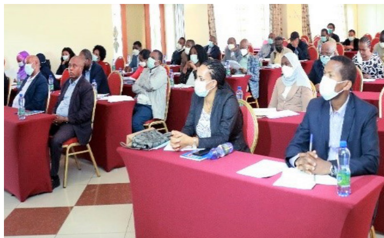
Stakeholders' platform to evaluate the fairness and effectiveness SPG infrastructural investment

During the reporting period HoF conducted an assessment and developed new mechanisms/frameworks about the fairness of SPG fiscal transfer and infrastructural distributions . In addition, monitoring and evaluation tools to examine the effectiveness of the allocations to ensure equitable distribution of federal infrastructure among Regional States were developed and adopted by HoF. These actions will further enhance the effectiveness of HoF to be better able to discharge its key role in ensuring equitable allocation of resources across the States.