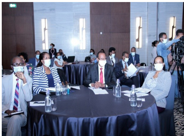
Fiscal federalism experts and stakeholders' discussion platform

Taken together these key interventions with the HoF have been able to realize improvements at a number of levels in how HoF operates and includes improvements in the HOF organizational working procedures, discipline, integrity, responsibility, and accountability including the strategic design and intervention of Nation building, ensuring rule of law, sustainable peace and enhancing proportional development.