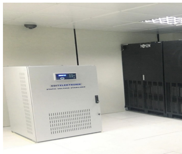
OFAG ATI/Data Center

OFAG improved its Audit Recommendation Tracking Information System [ARTS] which is essential for a Supreme Audit Institution (SAI) to monitor the implementation and resolution of audit recommendations. The system will help to automate the processing, reporting, and utilization of audit recommendations for the respective auditees. OFAG is also working to use a Balanced Scorecard Automation [BSCA] approach. The outcome of these initiatives will enhance the transparency and accountability of Auditees through remote auditing, effective communication with key stakeholders and the public.