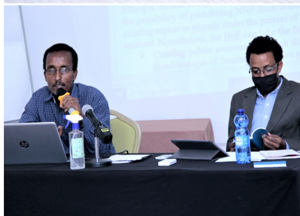
Experts and stakeholders while formulating frameworks to promote unity in diversity to ensure sustainable peace

The Ethiopian Constitution defines the fiscal relationship between federal and sub national governments by indicating the respective revenue/ expenditure responsibilities. The Constitution empowers HoF to allocate resources to Regions and City Administrations (Art. 62/7 of the Constitution and Art. 3/6 of the Proclamation No. 1261/2021). The Constitution has various provisions to ensure equal access to publicly funded social services and to ensure equal opportunities and fair distribution of wealth. Furthermore, those provisions seek to ensure systems and mechanisms for the fair distribution of wealth, inclusiveness, equal opportunity, and access to social and economic services of citizens and States.