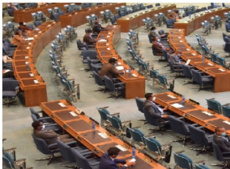
Scene from the PRN Conference 2021

This also helps to open up the space for increased civic engagement through the House having access to independent sources of research. The Conference has benefited all participants by sharing information and debating topics including the role of Parliaments, the Rule of Law and Human Rights; Parliament, Constitution and Constitutionalism; Parliaments in the Digital Age; and Parliaments and the Sustainable Development Goals.