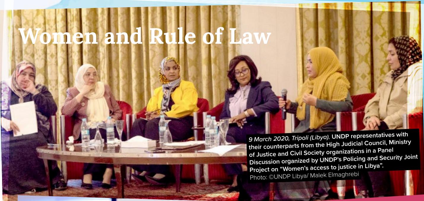
9 March 2020, Tripoli (Libya). UNDP representatives with their counterparts from the High Judicial Council, Ministry of Justice and Civil Society organizations in a Panel Discussion organized by UNDP's Policing and Security Joint Project on "Women's access to justice in Libya".

"Domestic violence has many forms. Strict laws that put an end to impunity for all perpetrators of violence will speed up response to such cases. Training sessions like this one will contribute to creating a legal environment that protects members of the society, including women."