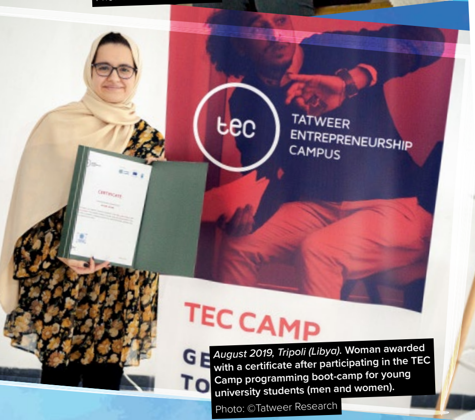
August 2019, Tripoli (Libya). Woman awarded with a certificate after participating in the TEC Camp programming boot-camp for young university students (men and women).

achieved significant strides towards its overall objective of fostering a vibrant entrepreneurial ecosystem to encourage sustainable job-creation in the private sector, for both men and women. In 2018, during one of the TEC activities, Aziza, Tufahah and Amine met, shared their ideas and interests in the field of education, and eventually created their startup, “School Connect,” which aimed at connecting teachers and parents to follow up on the children’s education. The App “School Connect” became “Panda” and nowadays counts nearly 10,000 students and parents of 30 schools registered. As the COVID-19 epidemic spread globally, in Libya, several educational institutions resumed teaching their curricula through electronic platforms, websites and social networks, Panda continues working to provide students with a greater number of lessons to avoid the interruption of their learning process. “Our company hopes, in the long run, to become a standard for educational technology in the country and the region,” says Tufaha. Since its launch with support from the European Union and UNDP partnership, TEC has inspired many young men and women across the country to establish their own business projects, adopting innovative technologies, and keeping pace with global developments in all sectors, with the overall objective of raising the efficiency and ability of the private sector in Libya.