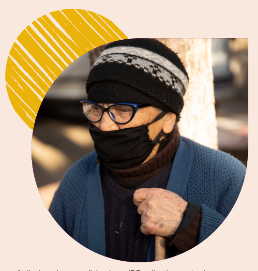
A displaced woman living in an IDP collective centre in Georgia where UNDP delivered basic hygienic items and improved sanitary infrastructure.

45 perpetrators of crimes against humanity and war crimes were condemned by military courts and tribunals. UNDP provided support to an investigation mission in Tanganyika to identify victims and witnesses in a case of genocide and crimes against humanity, as well as support to 7 mobile courts leading to 7 judicial decisions and justice for 453 victims of international crimes.