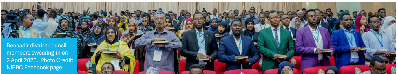
Benadir district council members swearing-in on 2 April 2026.

Official notice by the Supreme Court validating Benadir district council election results published on 28 March 2026.