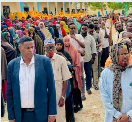
Citizens queuing to register in Jalalqsi district in Hirshabelle on 3 March 2026.

Electoral preparations are continuing across Somalia's Federal Member States as the National Independent Electoral and Boundaries Commission (NIEBC) advances district council elections. The Commission recently announced the opening of the campaign period and the submission of candidate lists, while confirming the districts scheduled to participate in Southwest State, Hirshabelle, Galmudug, and the Northeastern state.