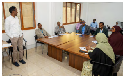
Election Observation Training of Trainers for SONSA.

From 23 to 26 February 2026, IESG carried out a Training of Trainers on election observation for six participants from Somalia Non-State Actors (SONSA) using a cascade training approach, with the aim of strengthening the organization's capacity to independently train its own election observers. The training focused on key elements of a credible observation process, effective knowledge delivery, and practical methods for transferring skills to future observers.