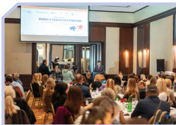
Expert meeting "Life in a Cage without Bars – Institutional Response to the Phenomenon of Coercive Control in Family and Partner Relationships"