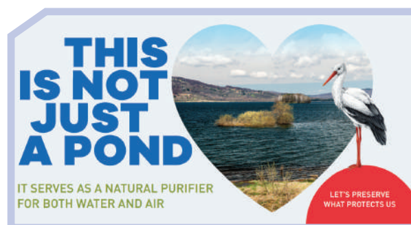
“This is not just a pond” campaign visual