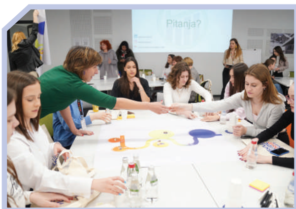
Event to mark International Girls in ICT Day