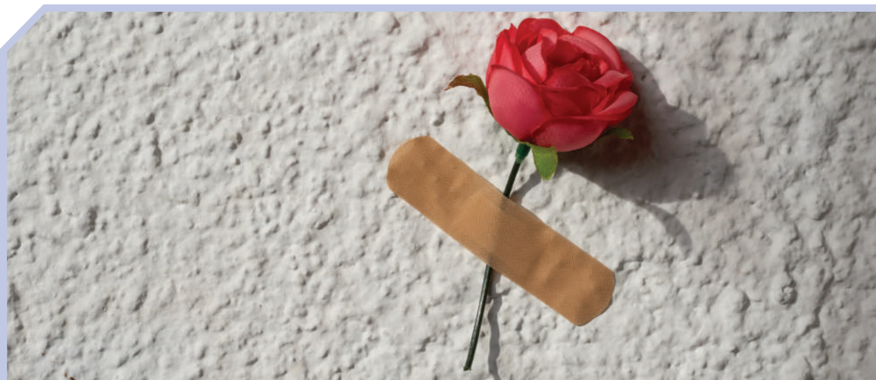
Photo credit: Ana Batrićević available for free use as part of the Photograph and Illustration Database for Ethical Media Reporting of Violence against Women. The database was created and updated within Swedish-supported efforts to promote media reporting that contributes to the prevention of violence against women.