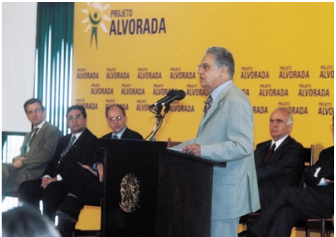
Fernando Henrique Cardoso, President of Brazil, launches the Alvorada Programme specifically targeting the 14 Brazilian states with the lowest rank in the human development index.

Around the world, countries—and even states and regions—now produce National Human Development Reports . South Asia was the first region to produce its own Human Development Report. The Arab countries will produce their first regional report to be launched in December 2001. In the last decade, more than 350 reports have been produced in