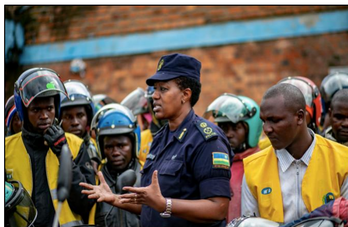
women and their working conditions

Rwandan National Police