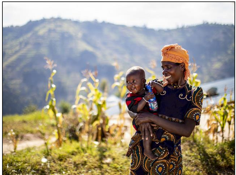
Kabaya Green Village in Ngororero – constructed to accommodate 11 families that were affected by disasters.

engaged in the paid labor market. 11 This "double burden" creates the risk of women burning out and being forced to choose