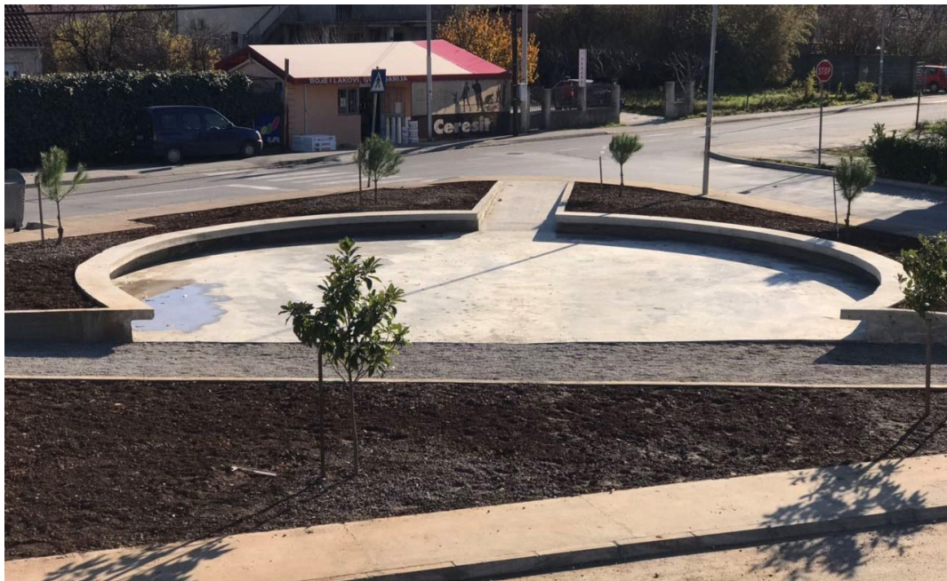
Photo 2 and 3. The location in question -square Princess Ksenija

Making a contemporary art installation will involve two segments: