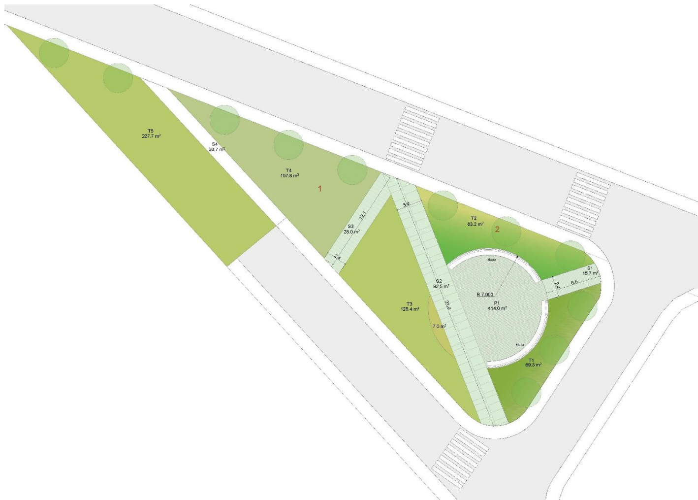
Photo 5. Layout of the square Princess Ksenija