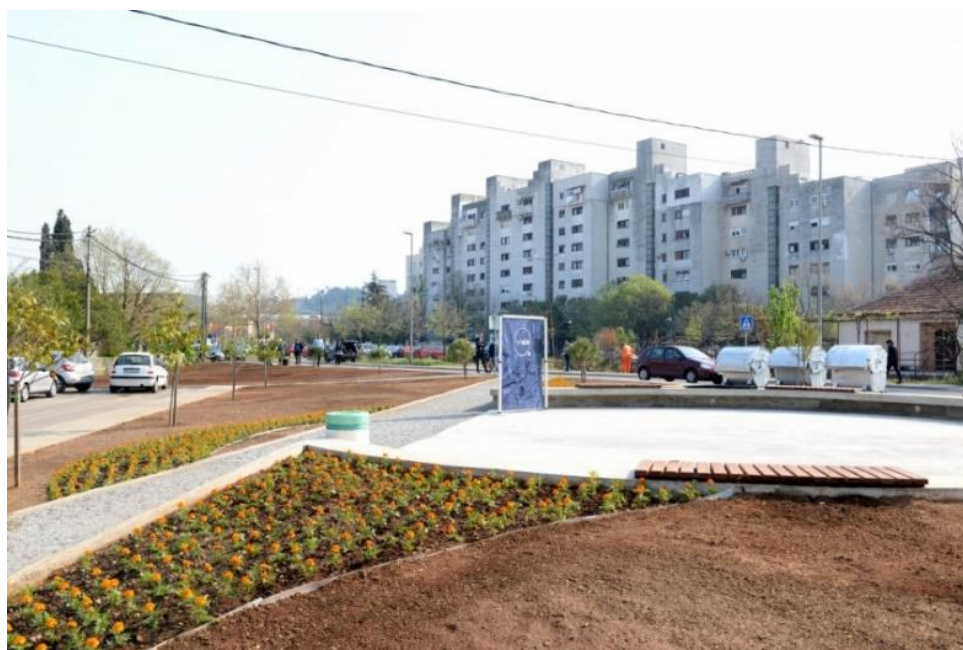
Photo 4. The location in question -square Princess Ksenija

Description of the site: The location of the square is at the corner of Princess Ksenija and Jozo Vukcevic streets in Podgorica.