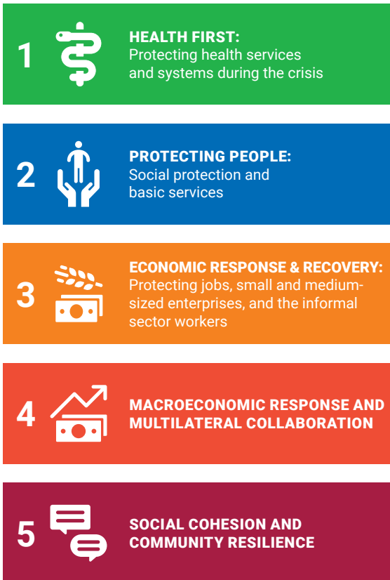
CHART 1: FIVE PILLARS OF THE UNDS RESPONSE