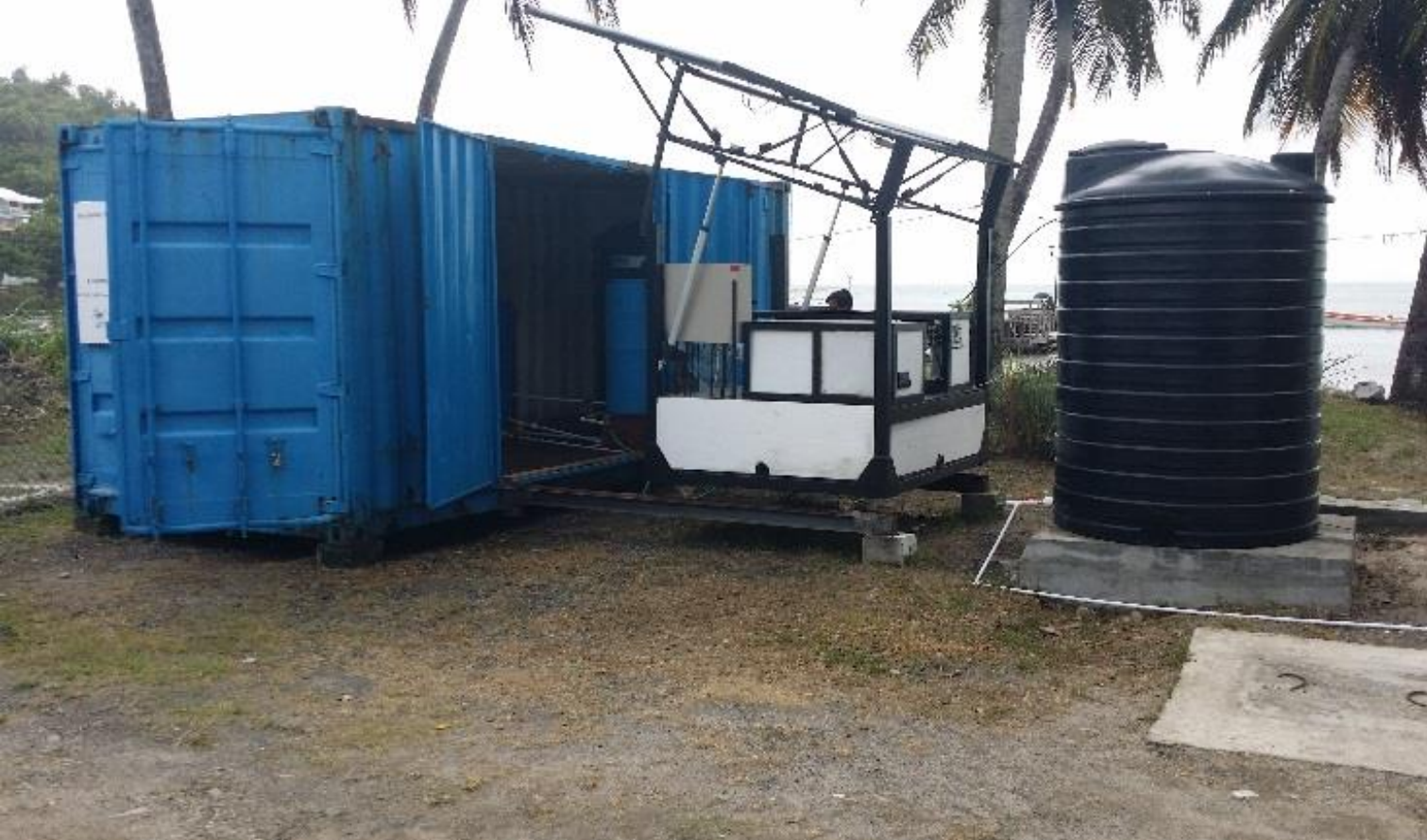
Desalination plant – Shipped to Republic of Nauru