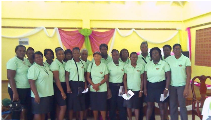
Belle Vue Kitchen Garden Group