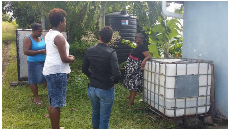
Rainwater Harvesting project