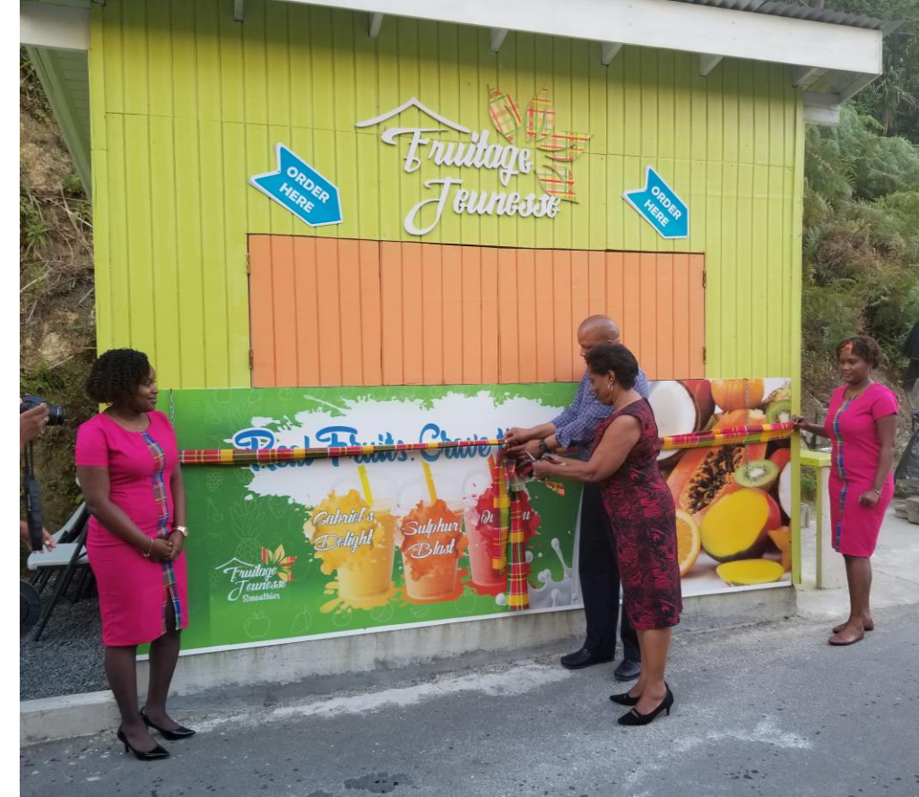
Community women's project – responding to increasing support