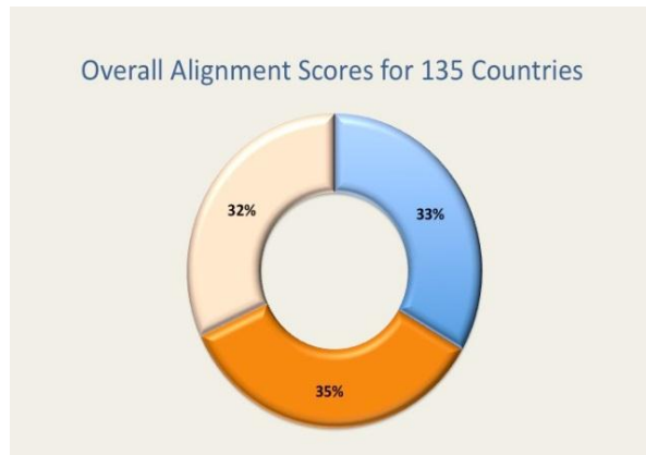
Figure 1: Distribution of overall Alignment Scores