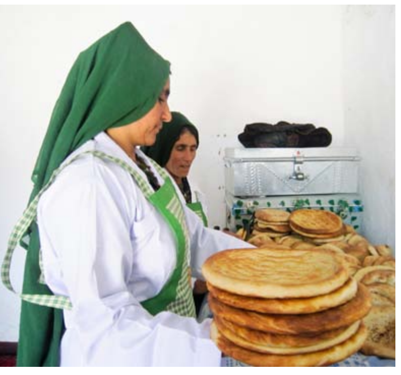
A women's group set up a bakery with the support of the Sida-funded project in order to sell bread to workers and bus passengers.

advantages of bringing money into the community and providing women with new skills, as well as promoting the idea that women can be key economic players in society.