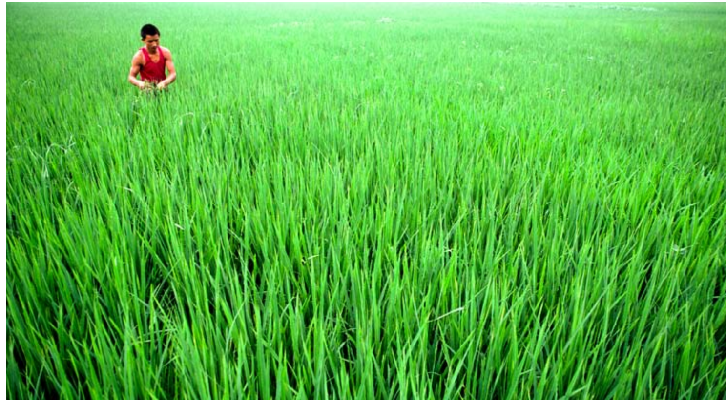
As the largest developing country with the fastest growing economy, China is facing environmental pollution and the danger of depleting some of its natural resources. The Government is using public procurement as an instrument to persuade producers, such as this rice farmer, to be as environmentally conscious as possible.

products with an environmental label, and not procure any products that are harmful to the environment or human health.