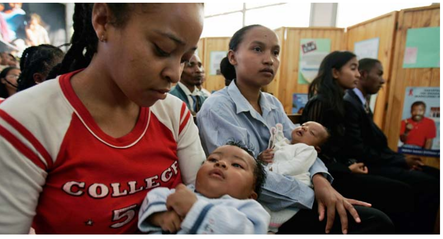
Mothers and their babies at a primary health centre ante-natal care site with voluntary counselling and testing, family planning and reproductive health in downtown Antananarivo, Madagascar.

is difficult for it to plan for customer demand, given that quantification for contraceptives is managed by the DFP. The data available to SALAMA come in the form of orders placed by its customers, and some customers are irregular in their ordering practices. Accordingly, SALAMA has to deal with a substantial number of emergency orders during the course of a year.