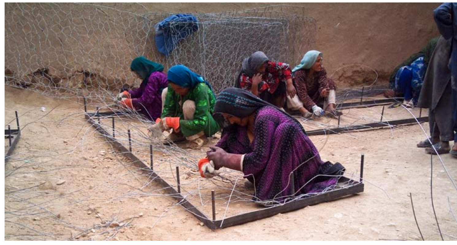
Women preparing wire baskets known as gabions as part of the Rural Access Improvement Project funded by Sida in northern Afghanistan. The gabions will be filled with stone and used to rehabilitate roads in the Sar-e-pul and Samangan provinces.

managers faced difficulties buying the necessary goods to construct the 113 kilometres of roads needed to link certain isolated communities. In particular, it was a challenge to find the hundreds of high quality gabion boxes (wire cages which are later filled with stone blocks) needed to create retaining walls. As they had already experienced success training local widows to provide the screened gravel necessary for construction, project managers decided to adopt a similar approach, which would also fulfil the project's cross-cutting aim to promote gender equity.