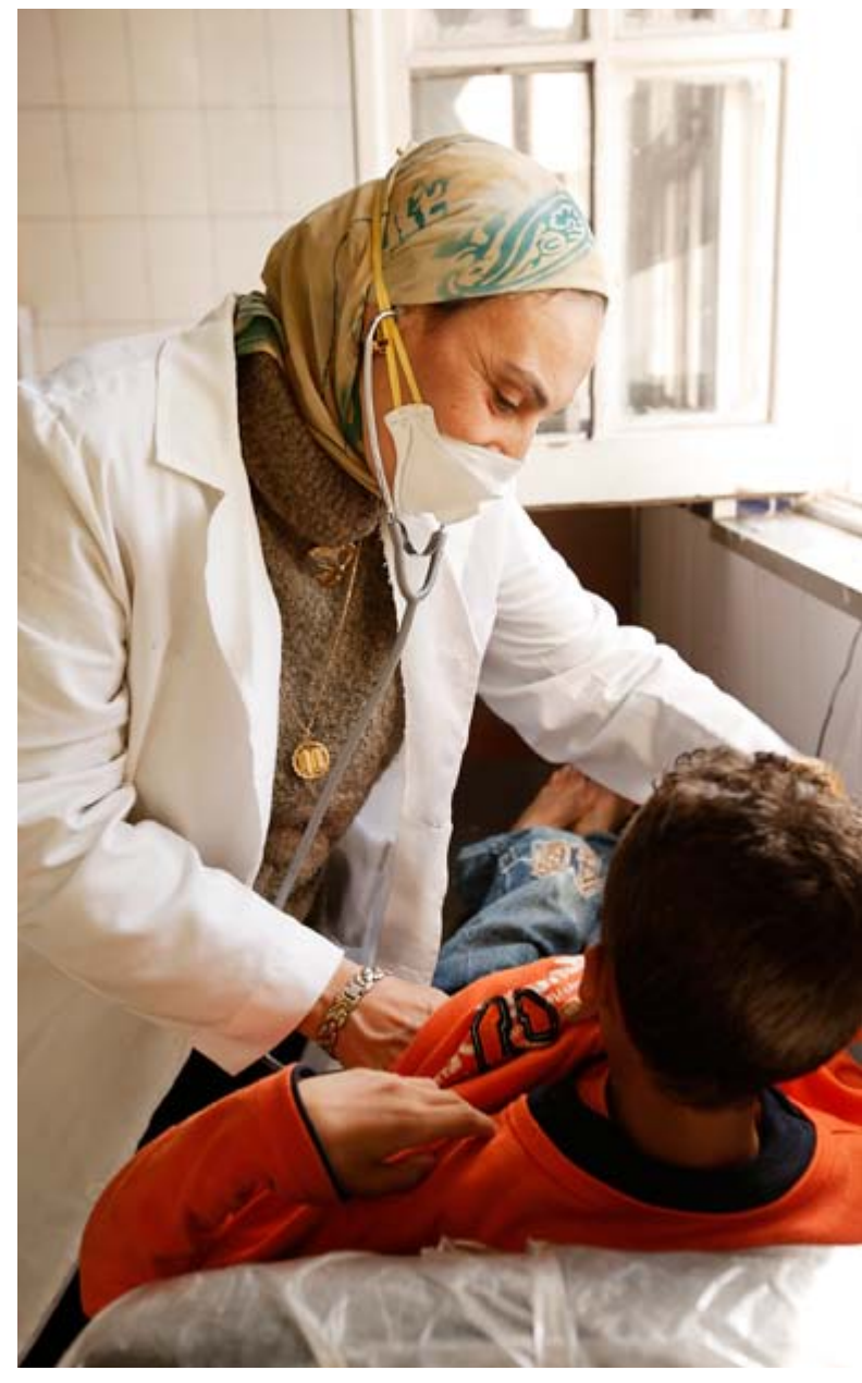
A health worker examining a TB patient. The Global Drug Facility helps drive universal access to anti-TB drugs, and supports the development of efficient national systems for their procurement and distribution.

The Global Drug Facility has laid a solid foundation on which progress can be based in the face of the challenges posed by ensuring access to anti-TB drugs. With an innovative Global Plan, assistance from the Stop TB Partnership, and new partners such as the Global Fund and UNITAID, the landscape is rich with potential for gains in the fight against TB.