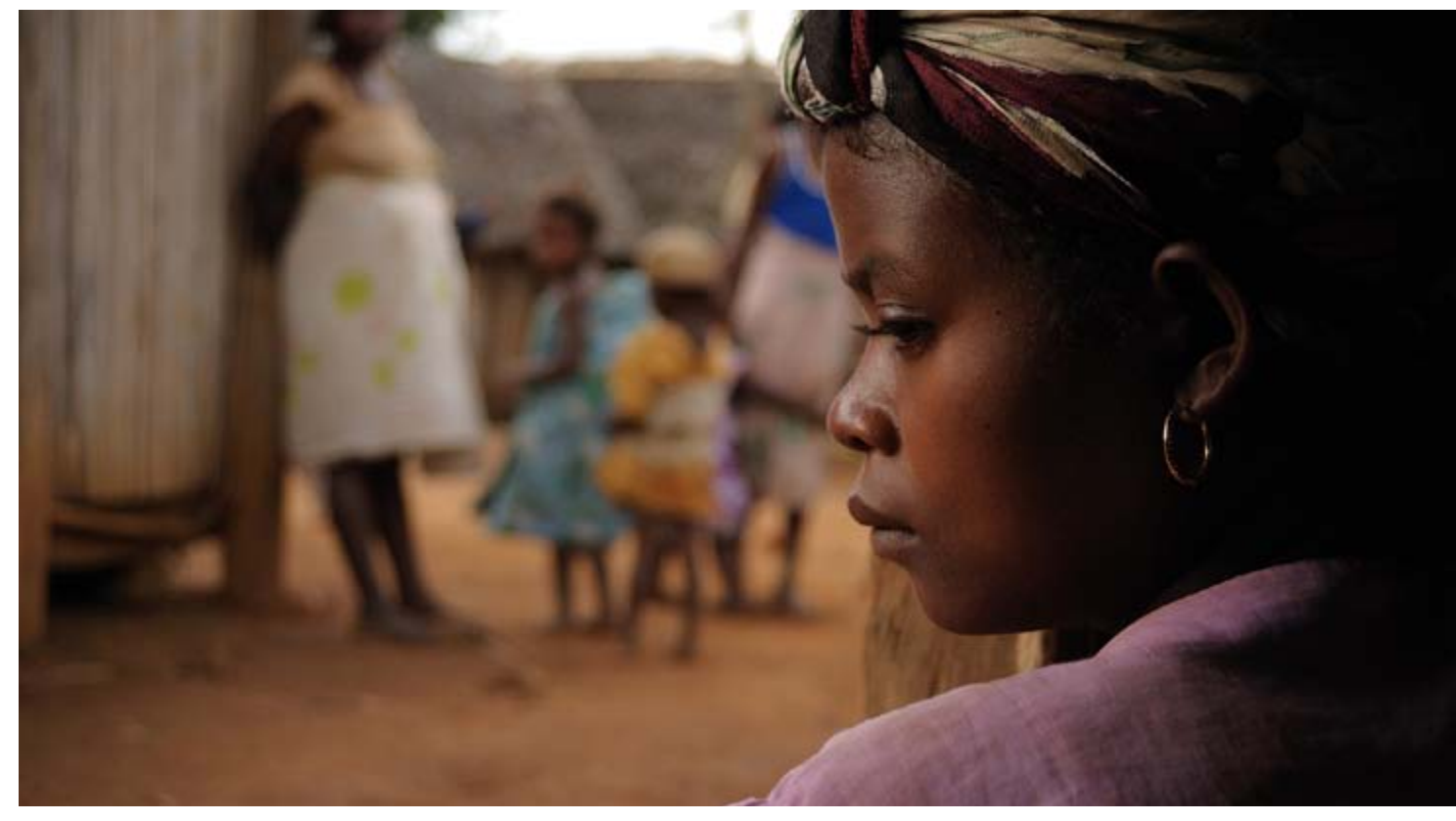
The Government of Madagascar's family planning programme, which uses a semi-autonomous not-for-profit organization for contraceptive procurement, is working to improve maternal health.