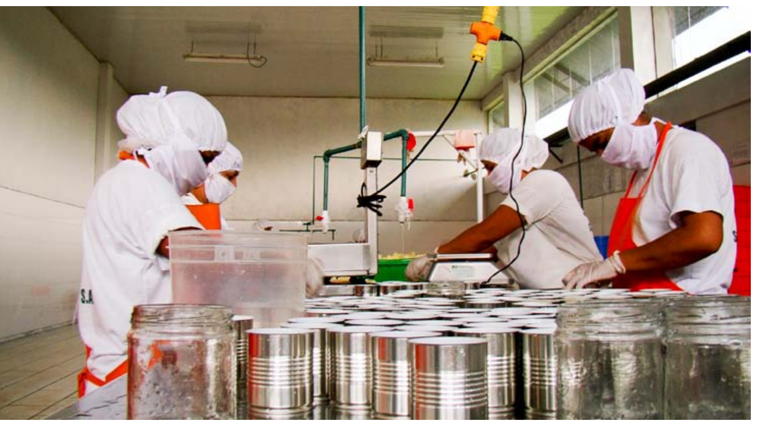
A small food processing business in Peru. When making procurement decisions, many public organizations give preference to local business to nurture small and medium enterprises (SMEs) with the underlying rationale that SMEs drive economic development.