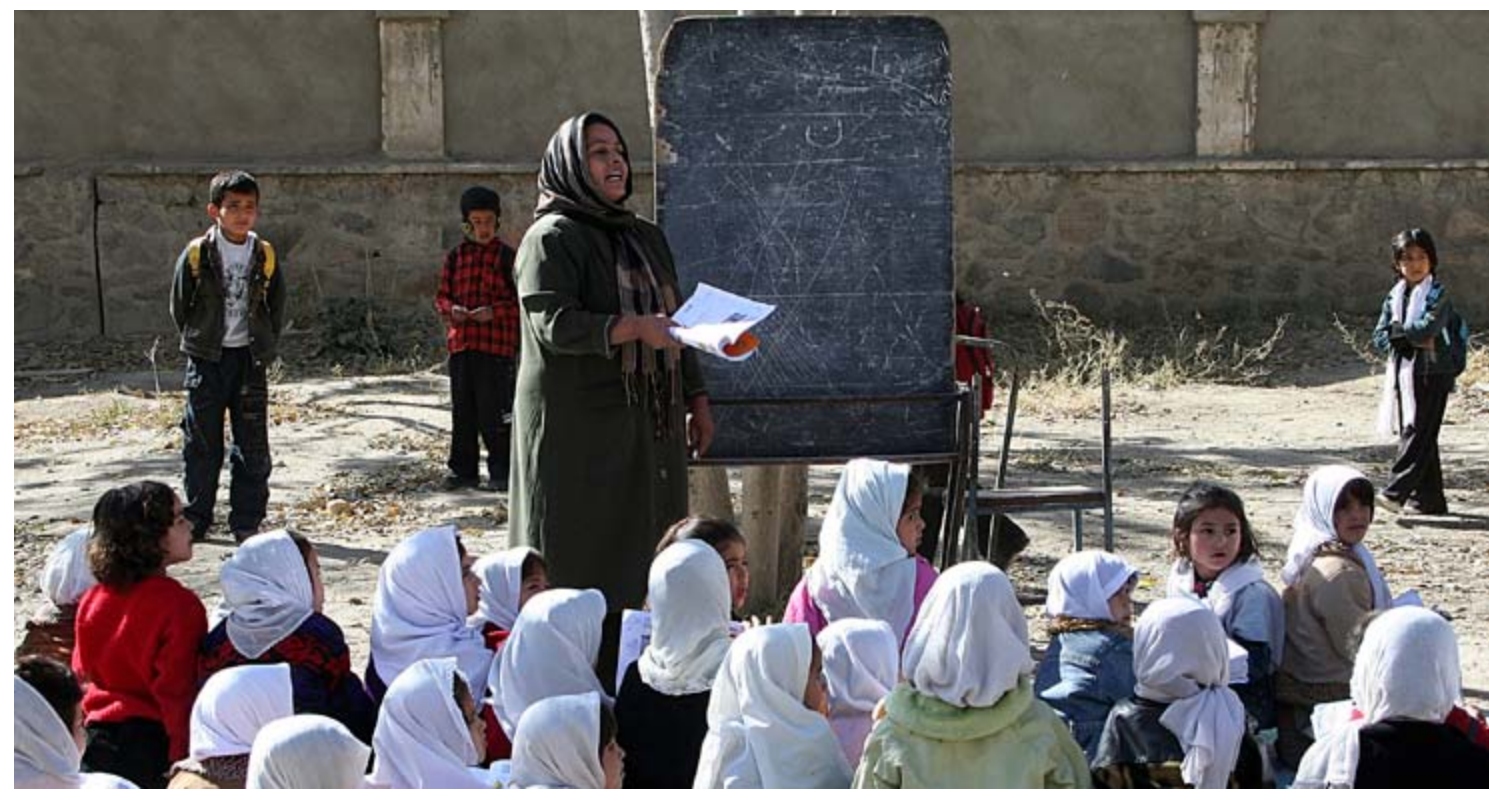
Afghan school children attending class with the support of the United Nations Children's Fund, which in 2008 enrolled nearly 340, 000 girls in grade one. There are 6.2 million children today studying in primary and secondary schools across the country.

manufacturers to track progress and identify problems. Countless obstacles were encountered: obtaining exemption certificates; getting custom clearance on time; negotiating port charges; flooded roads; identifying local focal points and ensuring they were ready to receive the supplies and more.