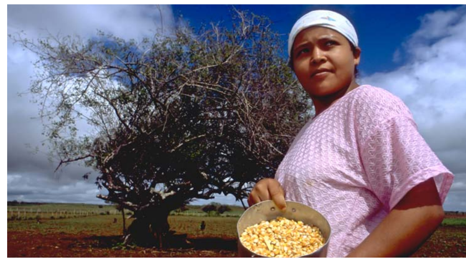
A woman plants maize in Poco Verde in the Brazilian state of Sergipe. Policies that improve producers' access to markets are crucial in efforts to tackle poverty and hunger.