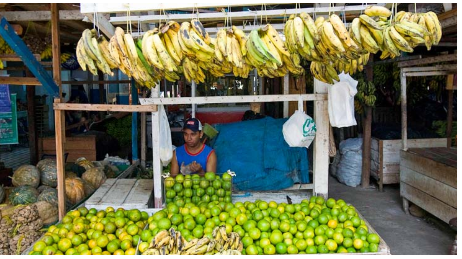
A variety of locally produced fruit for sale at a Brazilian market. The diversity of produce that smallholders can grow has been increased by the Food Acquisition Programme (PAA).

as matters beyond their control, such as weather-related damage to their crops.