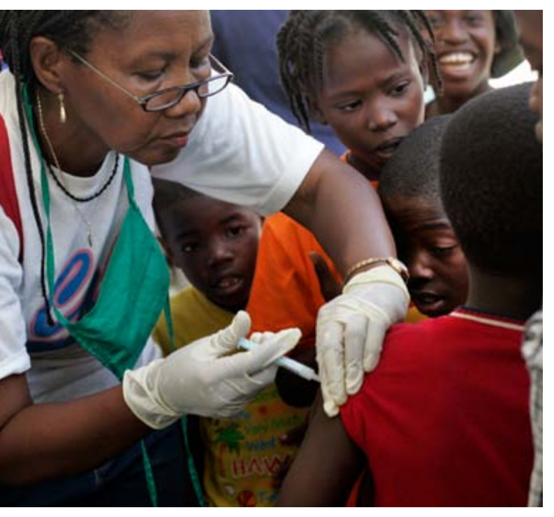
Cuban doctors administer diphtheria and tetanus vaccinations provided by the World Health Organization (WHO) to children at Delmas 33 IDP camp in Port-au-Prince for Haitians displaced by the earthquake.

In terms of revenue, these firms have seen their share of the vaccine market rise from approximately 50 percent in 1988 to about 70 percent in 2005. Small to mediumsized companies in Korea, India and Indonesia account for an additional 10 percent of the market share, with the remaining revenues going to small industrialized and developing country producers.