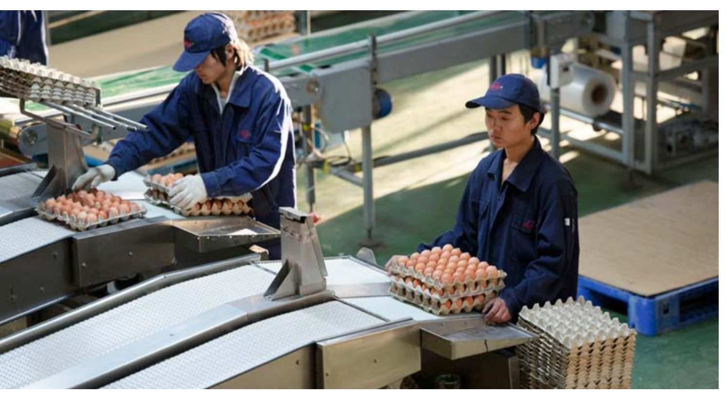
Workers inside the egg processing plant at the Beijing Deqingyuan Agriculture Technology Company in Beijing, China. The company is home to a project supported by the UN Development Programme (UNDP) and the Global Environment Fund which uses manure and water waste from some 3 million chickens to produce biogas for electricity.

Finally, the government should consider providing subsidies to allow the procurement of green products at a higher price than the market. The government can also offer tax breaks to encourage green production and consumption and levy higher taxes on products that cause pollution and over-consumption.