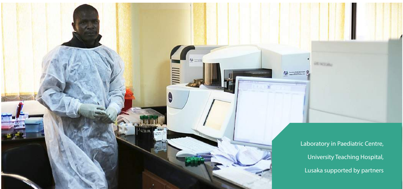
Laboratory in Paediatric Centre, University Teaching Hospital, Lusaka supported by partners