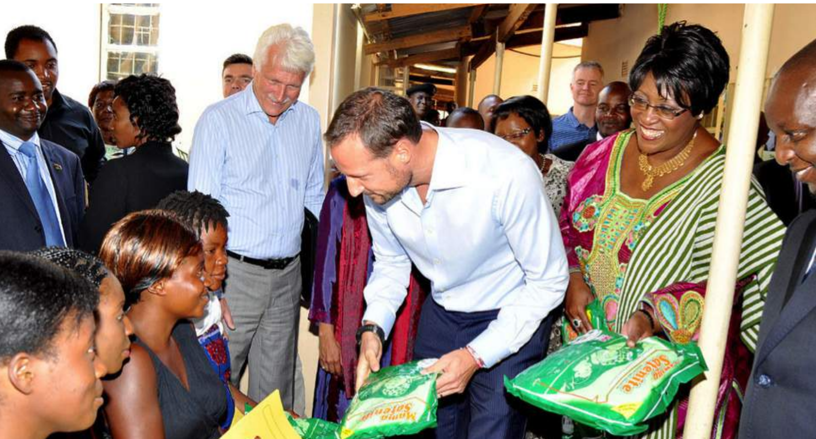
UNDP's Global Good Will Ambassador, His Royal Highness Haakon, Crown Prince of Norway along with the first Lady of Zambia donating Insecticide Treated Bed Nets to the Patients in Chongwe Hospital, Lusaka

In addition, in 2013 Zambia and Zimbabwe launched the Zam-Zim Cross Border Initiative aimed at eliminating malaria transmission in the border zones. The vision of this initiative is to have a malaria-free Trans-Zambezi community with social and economic prosperity by 2020. The joint initiative fostered better collaboration in harmonizing efforts to accelerate the elimination of malaria transmission among the bordering communities.