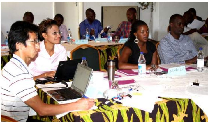
Joint PMU-MoH and UNDP orientation on Global Fund Policy and Procedures, 2012