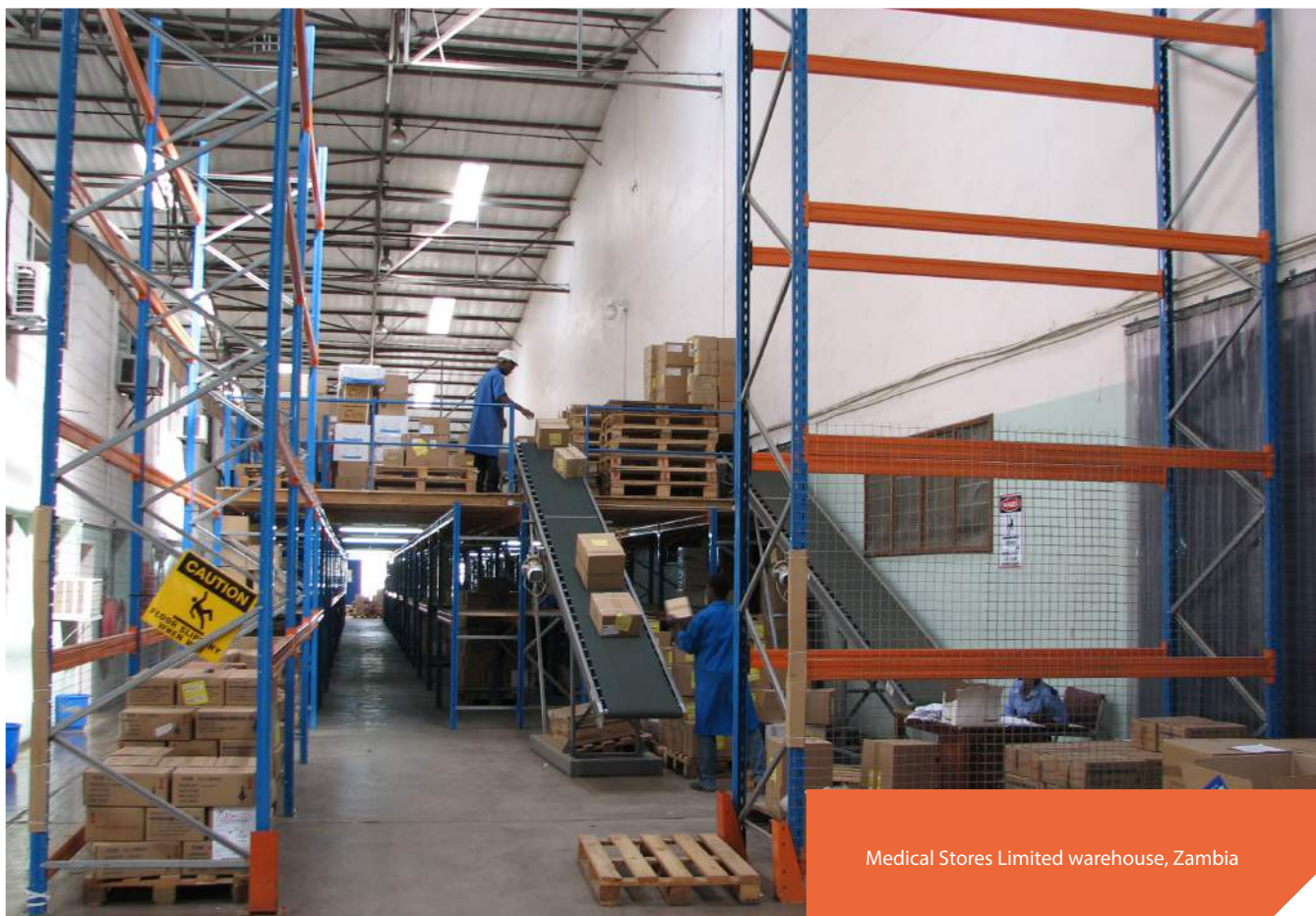
Medical Stores Limited warehouse, Zambia

UNDP support for the development and rollout of a new Standard Operating Manual for procurement in the MoH has been a major contribution to strengthening of the national procurement system. The manual sets out an organizational structure for national procurement and includes new guidance and procedures that