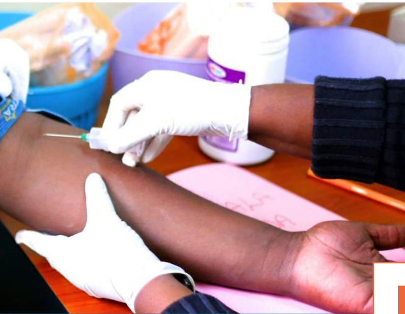
Ministry of Health, UNDP and Global Fund Partnership providing services to vulnerable groups