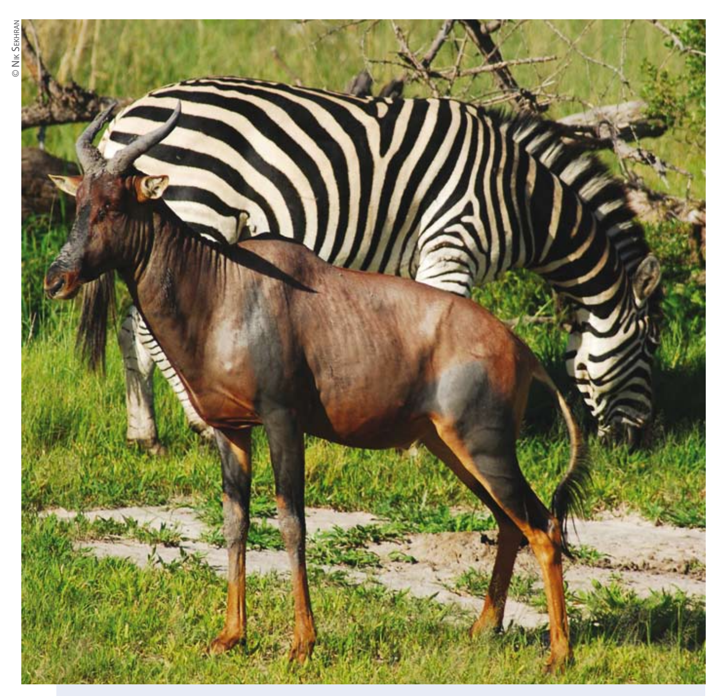
Tsessebe and Plains Zebra, Savuti Channel, Botswana

Additional information on UNDP's work on biodiversity management may be downloaded from UNDP's web site: www.undp.org