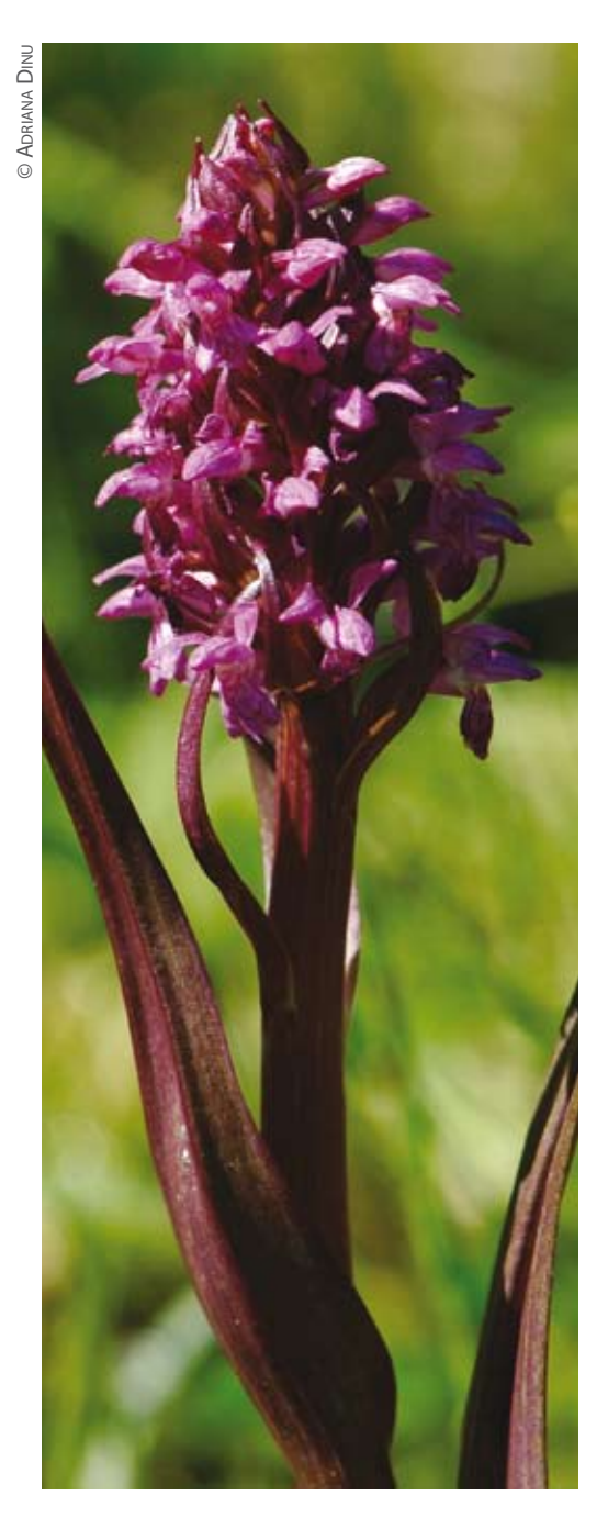
Orchids in Syktyvkar zapovednik - Russia: Dactylorhyza cruenta

Tanzania's forests act as a safety net for the extremely poor, providing them with resources for their subsistence and livelihoods. Studies have shown that 40% of total household consumption in some rural areas is accounted for by forest and woodland products such as honey production, firewood harvests, construction material, wild fruit and other foods. Sustainable management of forest resources is therefore essential, as is full stakeholder involvement in the design and implementation of forest management plans. Yet local communities often earn only a fraction of the value of forest products that they harvest. Recent economic analyses of the returns from timber harvested in southern Tanzania showed there is considerable scope to increase returns at the community level. UNDP has a number of initiatives in Tanzania, financed by the GEF, UN-REDD Programme, International Climate Initiative and UNDP core funds to strengthen forest management. This work aims, amongst other things, at setting up joint forest management systems with local communities and ensuring that a larger share of the income from forest resource harvests accrues to these communities.