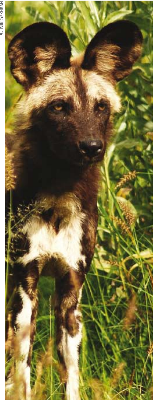
African Wild Dog, one of the world's most endangered large carnivores.

One of the key elements of the UNDP biodiversity strategy is restoration and sustainable management of carbon pools in natural ecosystems.