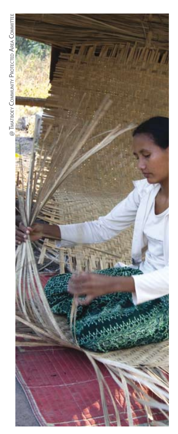
Weaving native grasses, Tmatboey Community Protected Area Committee, Cambodia, Equator Prize Winner

The GEF Small Grants Programme (SGP) has provided over 6,800 small grants, averaging US$ 23,000, to local NGOs, community-based organizations and indigenous peoples to safeguard the ecosystems and natural resources on which they depend. The SGP has engaged in literally thousands of partnerships across the world building a remarkable global constituency of civil society stakeholders in pursuit of biodiversity conservation and sustainable development.