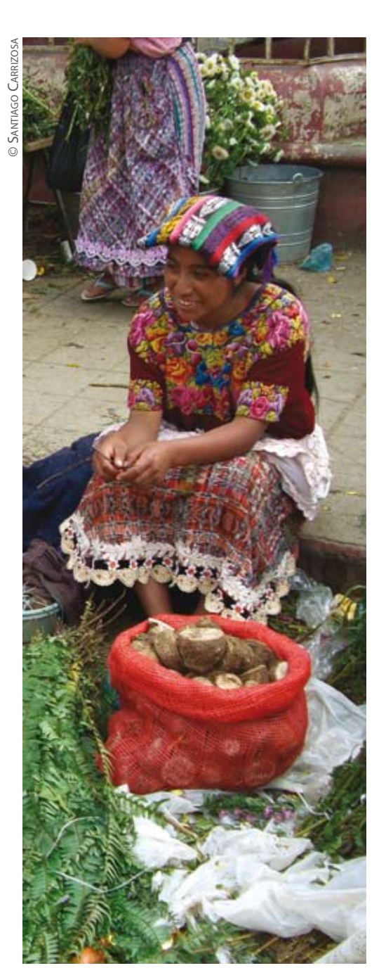
Street Market - Guatemala

Protected Areas (PAs) generate economic values in the form of tourism, ecosystem services and subsistence values for local communities. However, these values are rarely considered by governments and donors when making budgetary allocations to PA systems, and most remain underfunded. A key strategy of UNDP is to identify these economic benefits and institute business planning and development systems in PAs with a view to capturing them. Projects also seek to improve the capacities of PA managers to make strategic financial decisions such as re-allocating spending to match management priorities. Capacities to identify, design and implement revenue raising schemes are being strengthened. UNDP has developed a score card to help countries design and implement PA finance strategies.