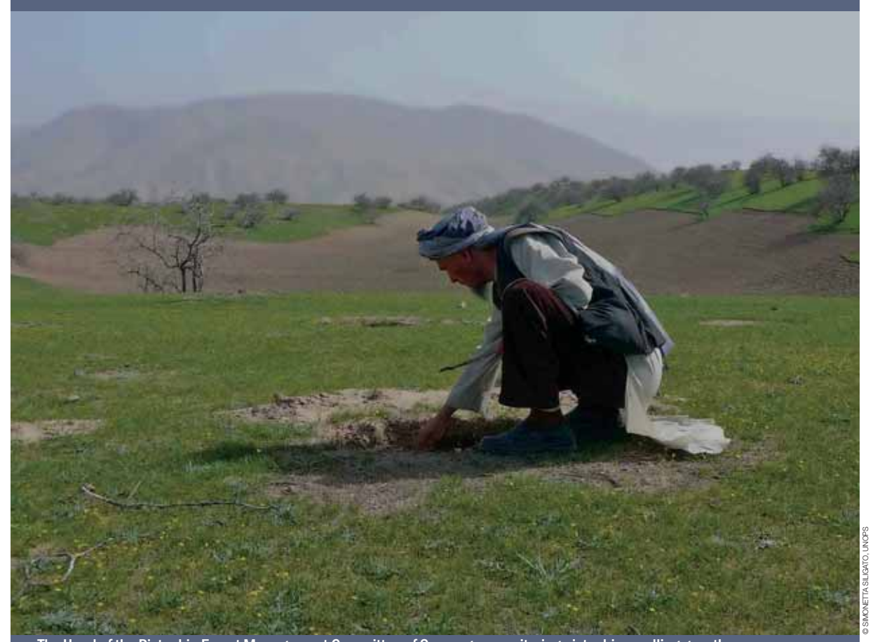
The Head of the Pistachio Forest Management Committee of Samangan monitoring pistachio seedling growth. Samangan province, Afghanistan, 2009

In the 2003 Post-Conflict Environmental Assessment of Afghanistan, the United Nations Environment Programme (UNEP) estimated that forest and woodland cover had been reduced in some provinces by 50 to 70 per cent over the past twenty years. 144 In a country where 80 per cent of the population is directly dependent on natural resources for their main source of livelihoods, forest are important sources of fuel wood for heating and cooking and for non-timber forest products, including pistachio nuts.