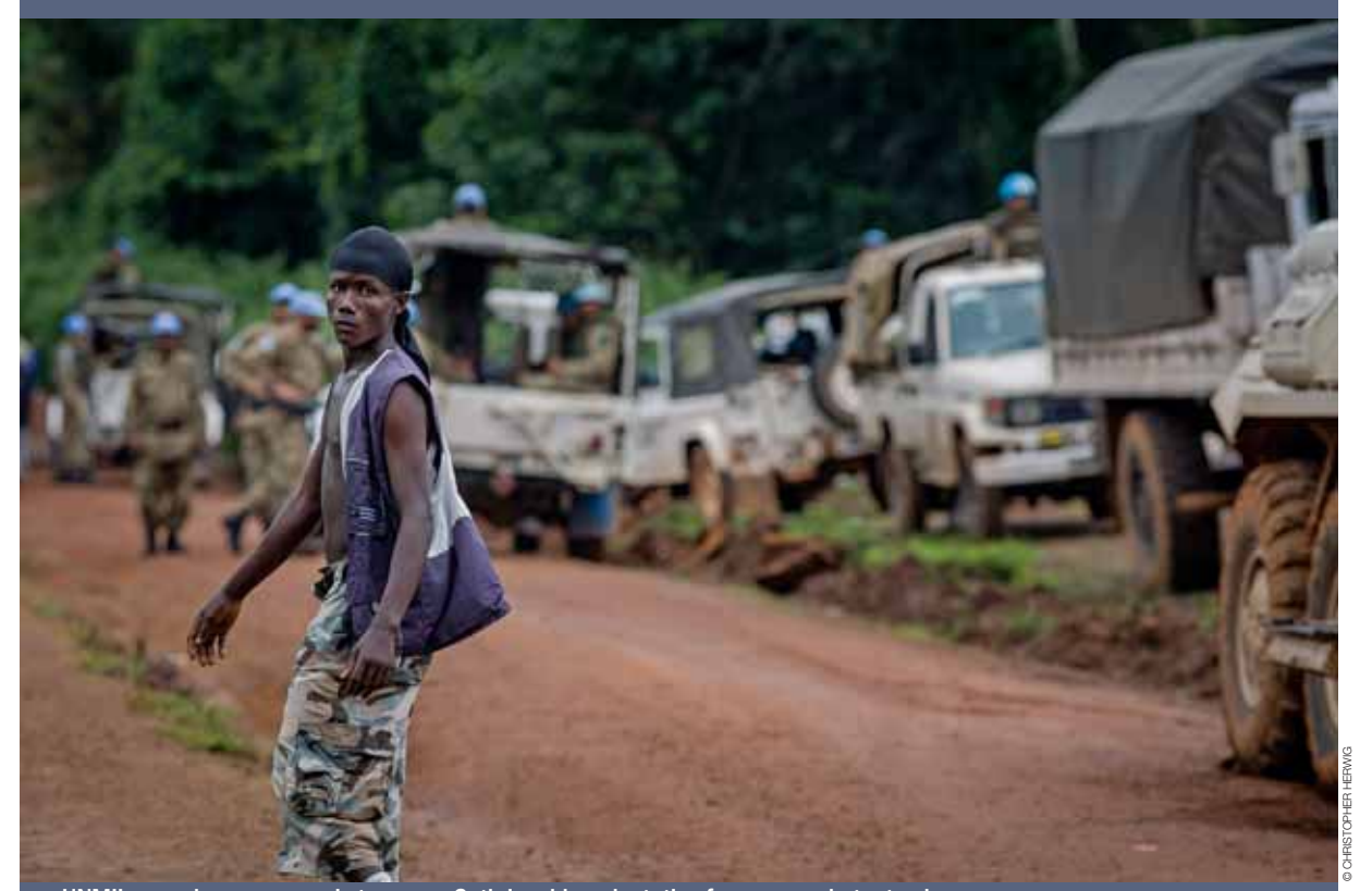
UNMIL peacekeepers move in to secure Guthrie rubber plantation from ex-combatants who were illegally tapping rubber in the area. Liberia, 2006

During the armed conflict in Liberia that ended in 2003, militia groups seized several lucrative rubber plantations, notably Guthrie and Sinoe.<sup>47</sup> The ex-combatants working on these plantations profited through the extortion of local rubber tappers and illegally imposed taxes, amassing tens of thousands of dollars per week.<sup>48</sup> While the UN Security Council put sanctions on diamonds and timber from Liberia during the conflict, rubber was not subject to any restrictions, in spite of its prominent role in the Liberian economy.