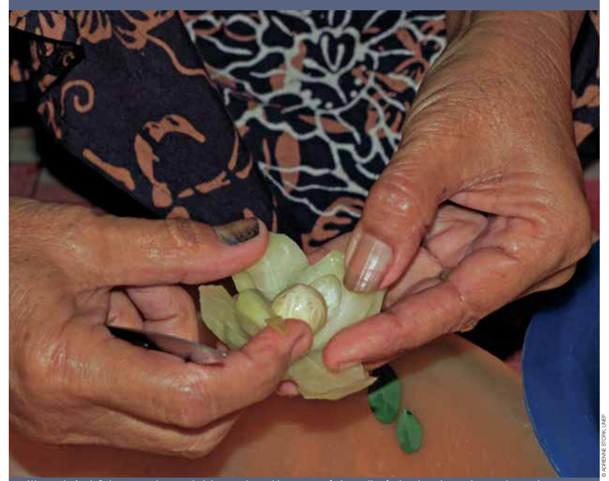
Women in Aceh Selatan supplement their income by making nutmeg fruit candies for local markets, whereas the seed and mace of the nutmeg is used to produce essential oil

Enhancing livelihoods and economic opportunities for intended beneficiaries requires the active collaboration of many actors and institutions. Forum Pala Aceh (Aceh Nutmeg Forum), established through this programme, and related government institutions, have all collectively participated in the implementation of the value chain strategy, covering cultivation, processing and marketing. 131 Particular efforts were made to engage business enterprises in strengthening supply chains and linking local producers and farmers. The product diversification trainings have not only improved their technical skills and knowledge of nutmeg farmers, but have also enabled them to expand their markets to other districts.