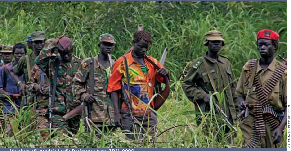
Members of Uganda's Lord's Resistance Army (LRA), 2006