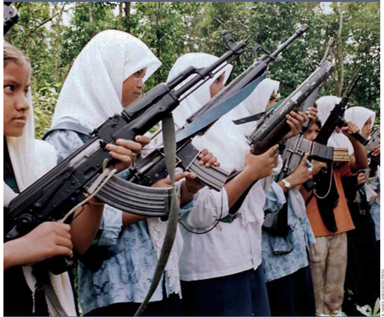
Acehnese girls in traditional Muslim dress pose with assault rifles at the camp of the Free Aceh Movement (GAM) in Pidie, Aceh province, Indonesia

Multiple grievances motivated the actions of the Free Aceh Movement (GAM) during the 30 years of civil conflict in the Province of Aceh, Indonesia, but the roots of these problems were connected to the operations and distribution of benefits from the local liquid natural gas (LNG) facility. There was a sense of injustice among the local populations stemming from the allocation of higher-paying jobs to workers from outside the province, combined with corruption and declining quality of life in the areas surrounding the operations, due to high levels of contamination and pollution. While LNG exports accounted for around 69 per cent of the Province of Aceh's GDP, most of these resources went directly to the central government in Jakarta and few development benefits were perceived in the province. In addition, there were other industrial developments in the area at the time, such as cement and chemical factories, that also gave cause for grievences, since few Acehnese were employed in these sectors. Local people complained of environmental degradation and the appropriation of traditional and culturally significant lands without compensation. They also resented the influx of foreign workers whose cultures were construed as offensive to the traditional Muslim communities in Aceh.