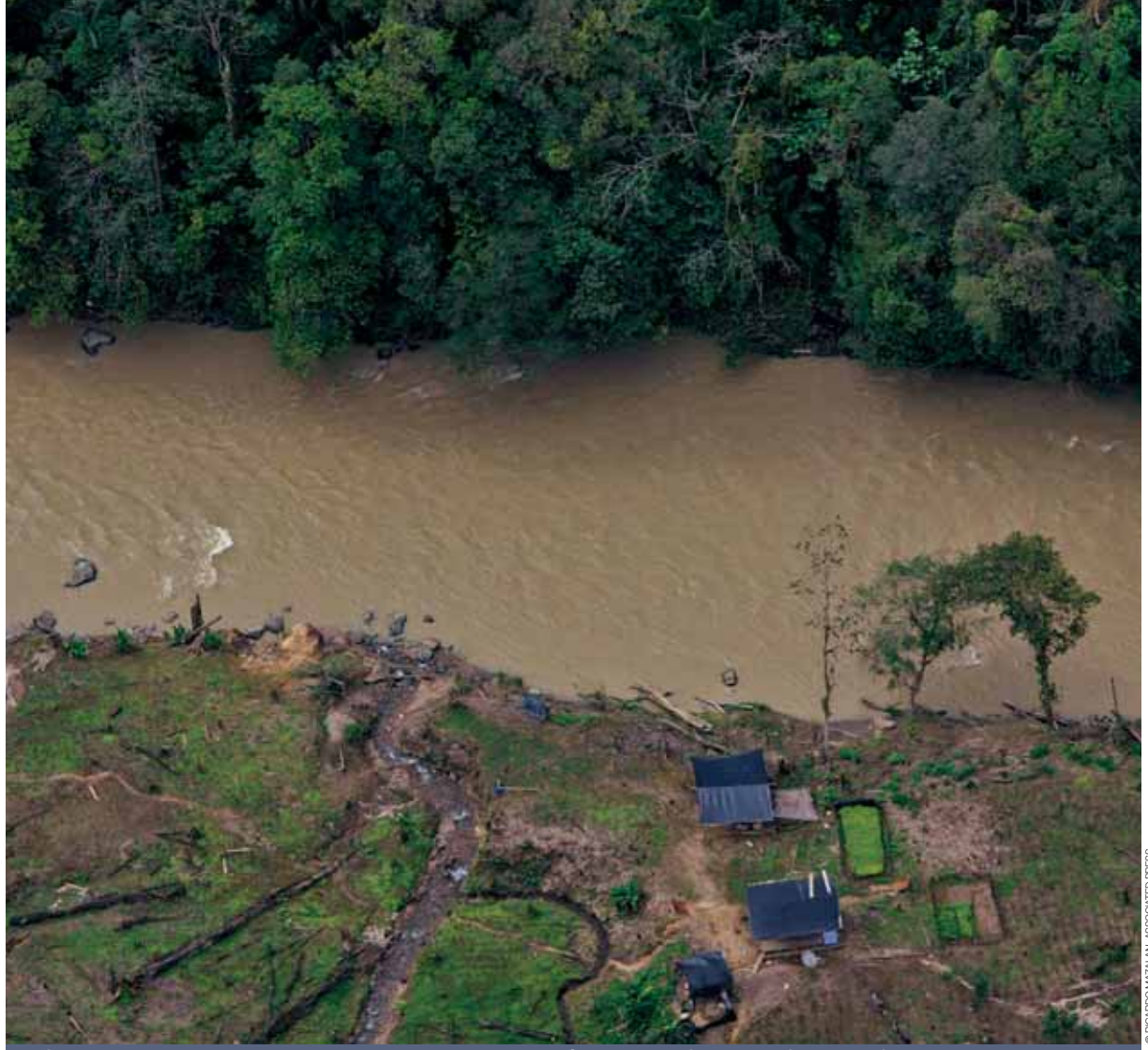
Coca seed beds, light green rectangles, are seen on the bank of a river in the Garrapatas Canyon, in Colombia's western Choco state. Natural resource-related issues in the Colombian conflict include land seizures by armed groups for illicit narcotics cultivation and deforestation

Major natural resource-related issues in the Colombian conflict include land seizures by armed groups for illicit narcotics cultivation and deforestation. More recently, militia groups composed of ex-demobilized fighters and FARC have targeted gold mines in the Córdoba region in north-east Colombia. <sup>63</sup> More recently, the government of Colombia and the leadership of the FARC have initiated peace talks and a first agreement was reached in May 2013 on rural land reform in the country. This agreement tackles one of the primary grievances and motivating factors for the decades-old insurgency. <sup>64</sup> Ensuing discussions on this throughout 2013 will determine if land reform will become a driver for peace or if it will continue to be factor in conflict.