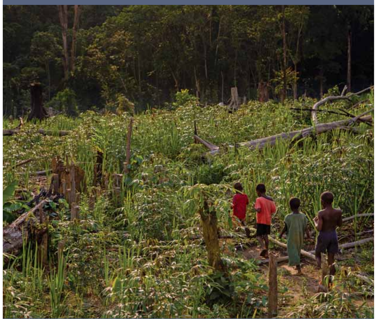
Sapo National Park in Liberia is located in the southern county of Sinoe near the city of Greenville. The park represents the largest remaining section of primary rainforest in West Africa. After leaving the nearby Sinoe Rubber Plantation, many ex-combatants moved into Sapo National Park and began destructively exploiting gold mines and harvesting timber

To address this problem, UNMIL and the Forestry Development Authority (FDA) created the "Sapo Working Group". Sensitization meetings and alternative livelihoods programmes were put in place to incentivize miners to leave the park. In addition, newly discovered diamond mines outside of the park attracted a number of miners to also leave. Eventually, however, the FDA had no choice but to attempt a forced evacuation of the remaining 1,000 miners left in the park. Those miners who were also ex-combatants requested entry to the DDR programme at the time, though the programme had by then closed after three opportunities for registration had been offered across the country. Failure to directly link the DDR programme with the occupation of the park meant that many ex-combatants were not able to benefit from reintegration support. In addition, the park suffered considerable damage from the mining activities taking place, which undermined government authority over the area.