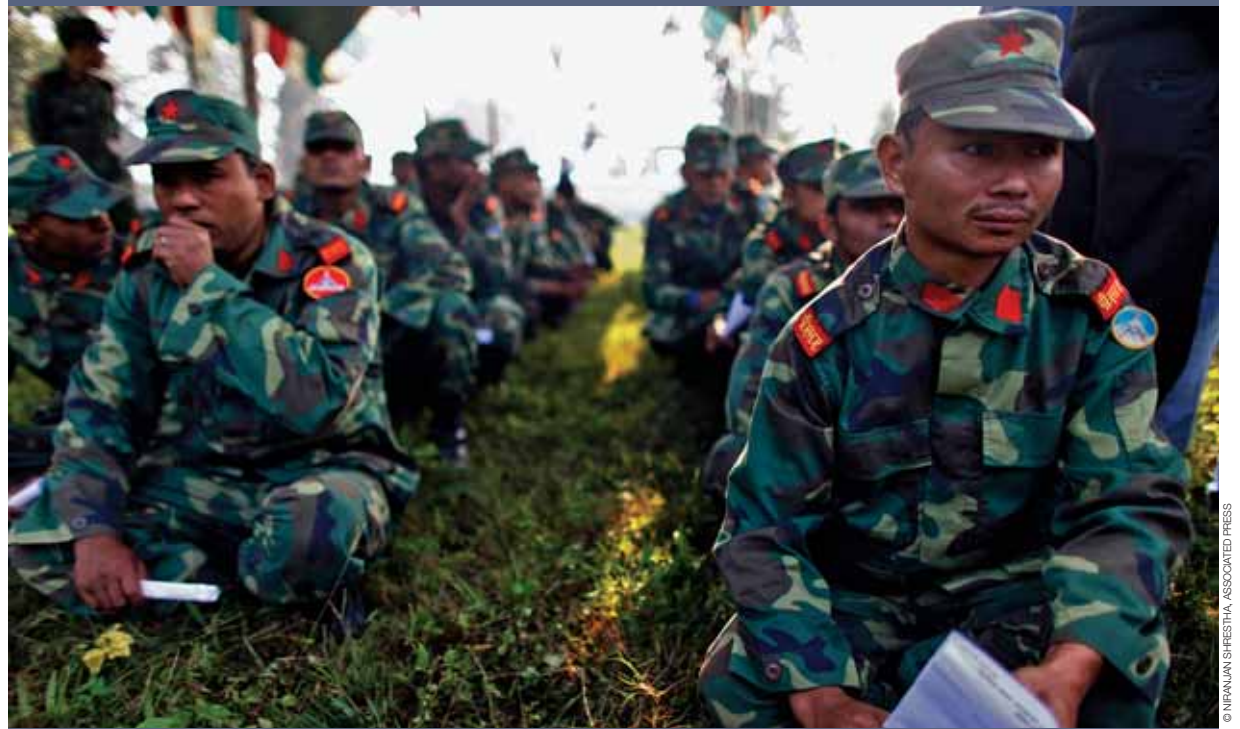
Former Maoist rebels attend an integration program at Shaktikhor Cantonment in Chitwan, Nepal in 2011. The interviews determined who will join the national army; the process continued for six years

After the signing of the peace agreement in Nepal in 2006, approximately 19,600 members of the Maoist fighters were registered and directed to one of 28 cantonment sites where they awaited news of their integration into the Nepalese National Army. Although the cantonments were originally intended to be in place for six months to one year, the process continued for six years.