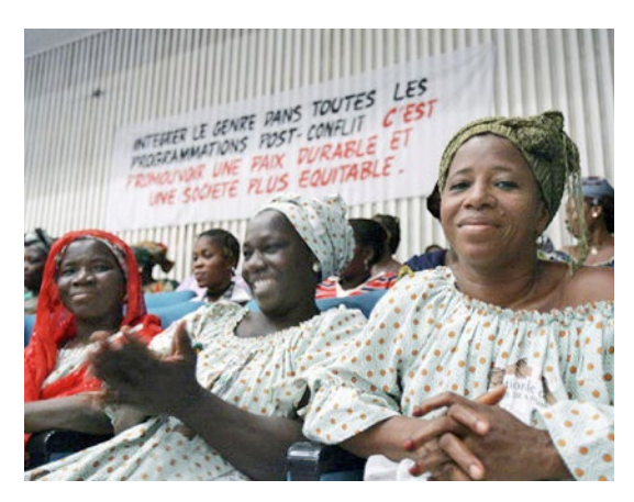
Women celebrate International Women's day in Cote Iviore

representation in the police and reporting of sexual assault. Ensuring that women are represented in courts and on legal teams can play an important part in making courts more accessible. UNDP has supported the professional development of women as rule of law actors systematically in crisis countries.