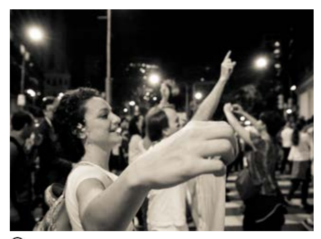
Protestors in Brazil march against price-rises on public transport.