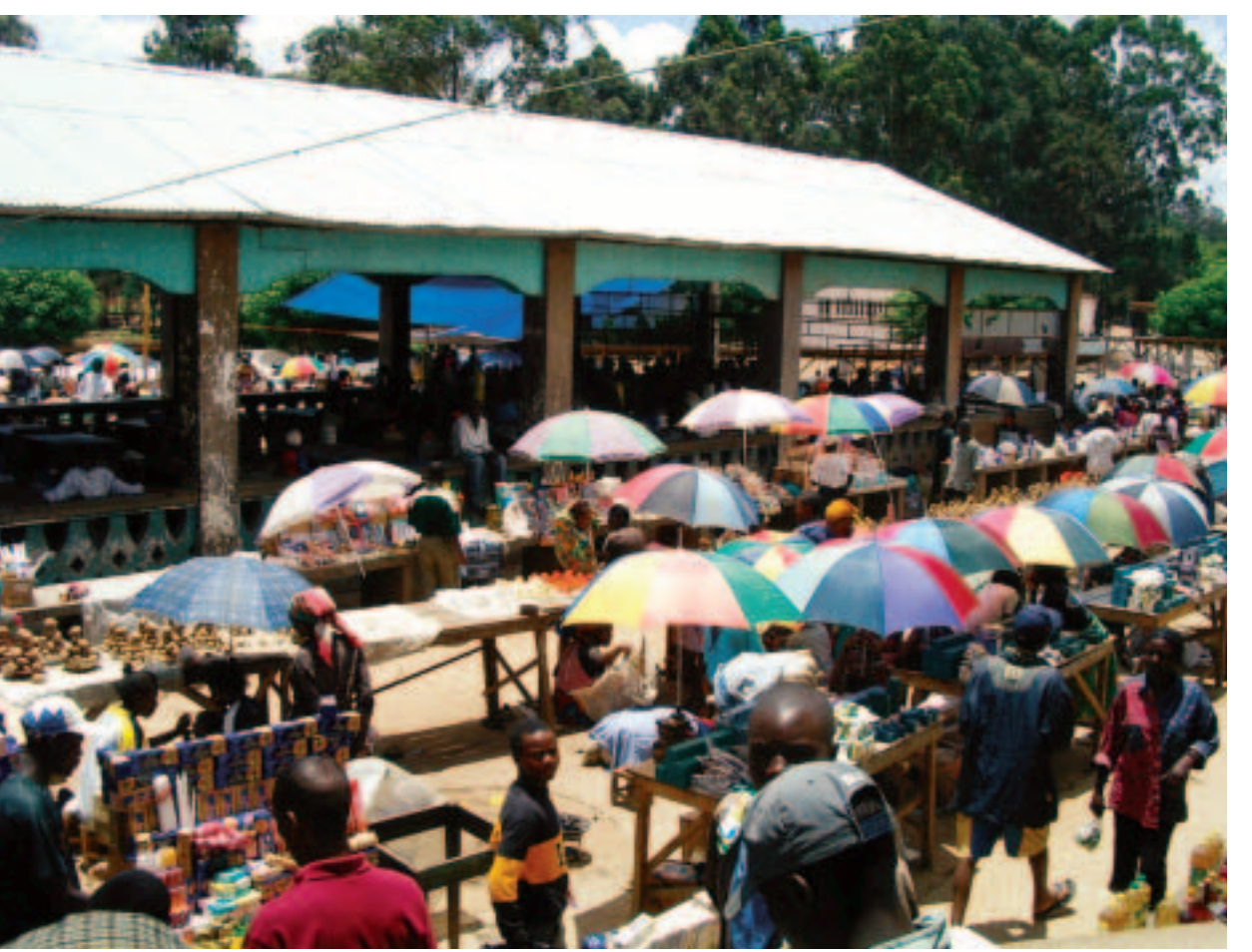
All over the developing world, markets like this one in Huambo, Angola, are hives of entrepreneurial activity. With the right forms of support, they have the potential to make major contributions to faster economic growth.

More broadly, UNDP has long been a strong supporter of making the links between poverty reduction and a flourish-