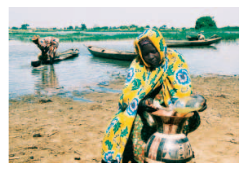
In Niger, once villagers learned to manage the routine cleaning of a local pond, they were able to cultivate new livelihoods, including through a fishing cooperative.

This builds on an earlier initiative where UNDP supported the formation of local water committees in over 1,000 villages, in partnership with the European Commission, African Development Bank and the Swiss Agency for Development and Cooperation. Members learned to manage community reserves in ways that benefit both people and the environment. In the village of Allimboulé, for example, the local pond used to be full of silt and sewage. With UNDP's support, villagers cleaned the pond. A team from the water management committee now makes daily rounds to remove new filth and animal carcasses, while women trained to propagate seedlings have planted windbreaks to protect the pond against silting. With the pond now teeming with fish, a cooperative has formed. Some of its earnings have gone into the development of land for irrigated crops, a testament to how creative and targeted capacity investments can multiply people's options—and their abilities to act on them.