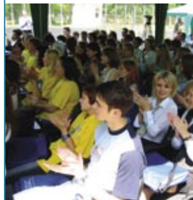
Thousands of youth in Romania have been reached through the AIDS prevention programmes.