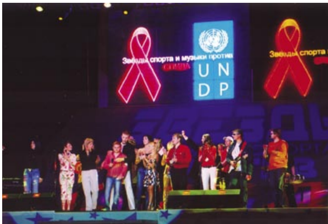
Athletes and musicians take the stage to address HIV/AIDS in Belarus

UNDP provides support in administering the five-year, USD 7.2 million GFATM grant to World Vision International, Armenia’s Principal Recipient. The funds support vulnerable groups, the general population, the uniformed services in