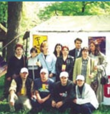
Volunteers get together to address HIV/AIDS in Romania