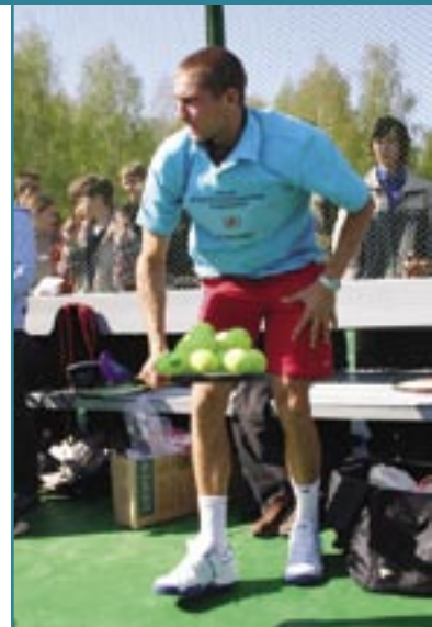
Tennis Star Maxim Mirny uses his popularity to raise awareness about HIV/AIDS in Belarus

In 2004 UNDP Belarus organized an active awareness campaign 'Sports and Music Stars against AIDS'. Tennis star Maxim Mirny and other notable national athletes and popular musicians participated in a concert, attended by 3,000 youths, to raise awareness of HIV/AIDS. 9 People living with HIV/AIDS, physicians and HIV experts were also part of the audience. Several national broadcasts of the event reached millions of viewers and were instrumental in establishing sports and music as entry points to addressing the epidemic among youth.