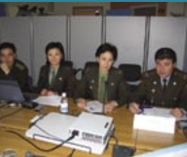
Police Officers attend a sensitization programme in Kyrgyzstan

Additional factors fuelling the epidemic in Eastern Europe and CIS region are prison conditions and stigma and discrimination towards vulnerable groups.