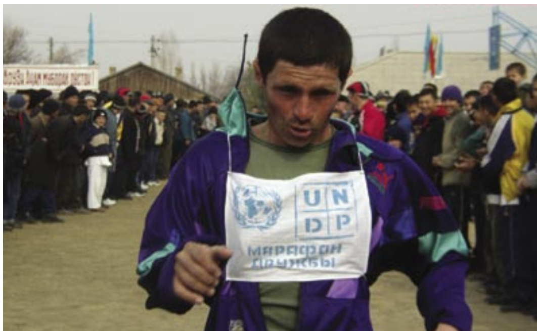
A participant in Kyrgyzstan at an UNDP event to address HIV/AIDS

UNDP has also engaged the media, and in 2004, a media centre with information on HIV/AIDS was set up in Aki-Press, one of the leading press agencies. This has been a significant success given the historical absence of HIV/AIDS media coverage and the lack of commitment from media owners to be involved in HIV prevention. As a result of increased media coverage, the nature of the epidemic in Kyrgyzstan has been uncovered, addressing – for the first time – stigma and discrimination.