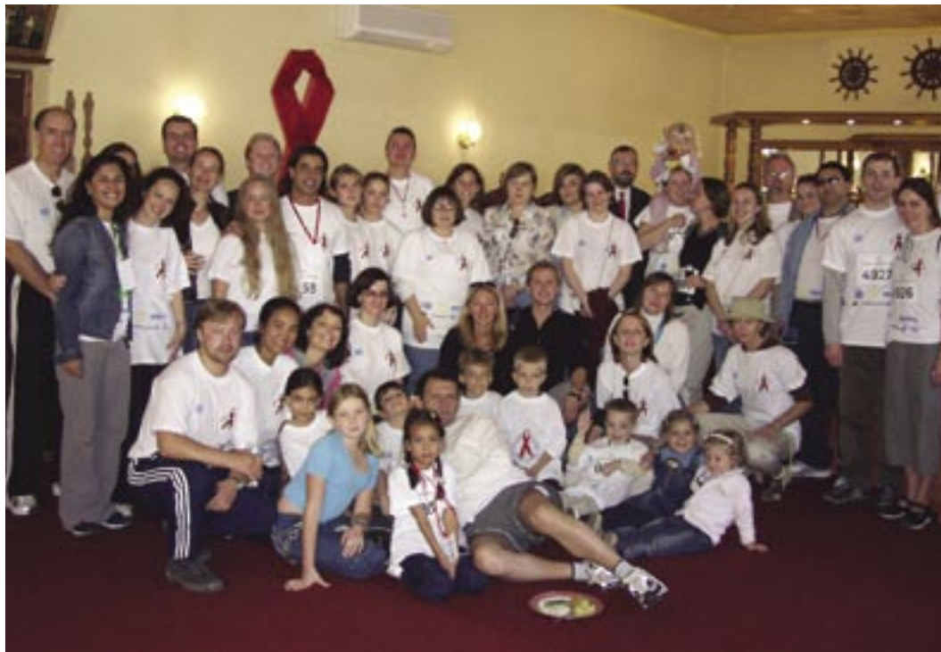
Bringing together stakeholders to generate extraordinary results: LDP in Ukraine

These initiatives were groundbreaking given the high level of stigma and discrimination in the communities towards men who have sex with men, people living with HIV/AIDS and injecting drug users.