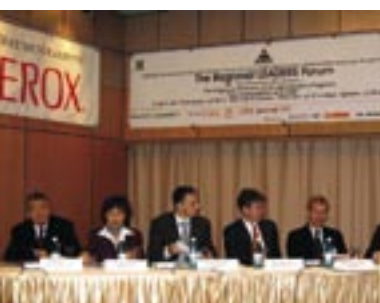
Strengthening national capacity: Regional Leaders Forum 2003 in Romania

Given the success of their regional projects, UNDP, UNAIDS and UNICEF, decided at a consultative meeting in Poland in May 2001 to scale up their efforts.