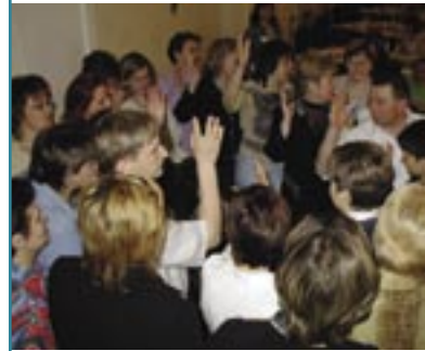
Participants at an LDP workshop

A team from a highly affected region partnered with government representatives to set up an outreach system to locate and establish contact with those dying of AIDS in their homes. They provided them with food and other amenities.