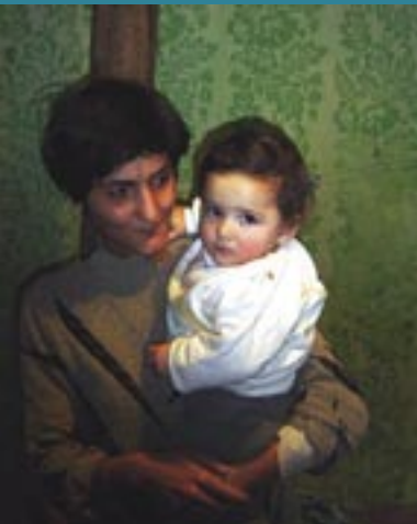
UNDP in partnership with the Global Fund is working to stop parent to child HIV Transmission

As a result of the financial support, many countries were able to develop and implement initiatives that addressed HIV/AIDS.