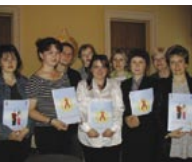
Leadership Development Programme: Participants take a stand to address HIV/AIDS in Ukraine

The methodology is designed to tap into individuals' innate abilities in order to generate a complex understanding of issues and, in this context, generate innovation to produce results. Leadership for Results has made a significant contribution in Ukraine and Russia in responding to HIV/AIDS. The countries have participated in the Leadership Development Programme (LDP), one component of the Leadership for Results Programme. 5