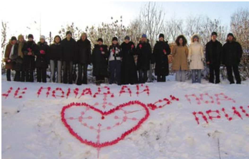
Children participate in raising awareness: The 'Tulips on the Snow' Initiative was a part of the World AIDS Day Campaign

Beginning this year, UNDP will align the Leadership Development Programme and other programme resources strategically in support of the national application of the 'Three Ones' principles, together with UNAIDS and other co-sponsor agencies. UNDP and UNAIDS have already supported the establishment of a national Monitoring and Evaluation (M&E) unit within the Ministry of Health's Federal Service responsible for HIV/AIDS, including the provision of cutting-edge IT infrastructure, the establishment of the Country Response Information System (CRIS) tracking mechanism, and the organization of national M&E trainings. UNDP will also play a key role in supporting the development for an inclusive national policy and action framework, including a new federal targeted programme on HIV/AIDS to replace the current programme that expires next year.