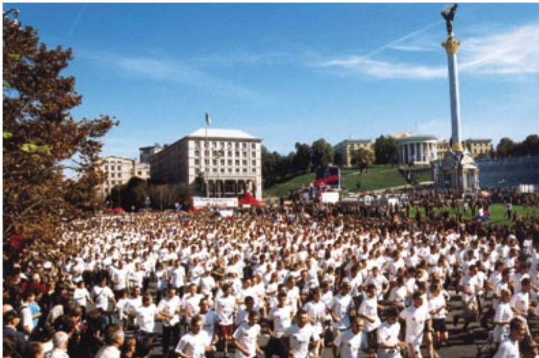
Thousands of people come together to show support in reversing HIV/AIDS in Ukraine's "Race for Life" awareness event

Leadership Development Programmes are implemented with leaders from all sectors of society—government, civil society, private sector, media and arts etc.—over the course of six to nine months. In addition to workshops and coaching sessions, participants plan and implement innovative projects known as breakthrough initiatives. What makes this programme unique is the fact that the initiatives it generates are truly 'home-grown' and respond to the urgent needs of people, while addressing the underlying causes driving the epidemic.