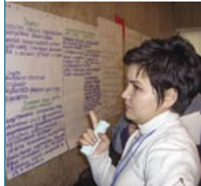
NGO worker takes part in a workshop to address HIV/AIDS

mainstreaming HIV/AIDS into national policy, the effectiveness of harm reduction programmes, and identifying breakthroughs, including applying for and receiving Global Fund grants. Using transformative methodologies the workshop sought to identify innovative approaches to planning in order to implement a cohesive, systematic and sustained national response.