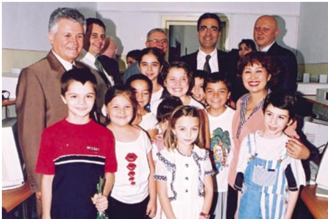
UNDP creates an enabling environment: Children participate in an awareness raising initiative "All about Sex" in Romania

UNDP's multi-sectoral approach, which addresses the underlying causes of the epidemic, has been crucial in fostering action in places where before there was only resignation.