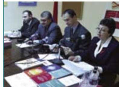
UNDP focuses on strengthening national capacity in Armenia

In the previous years, UNDP supported the preparation and implementation of two National HIV/AIDS programmes (1997-2001 and 2001-2005). UNDP supported nine ministries, two state commissions and four districts in their prevention and care programmes. In addition, a unit for Coordination, Monitoring and Evaluation of the National HIV/AIDS programme has been set up in the Prime Minister's office.