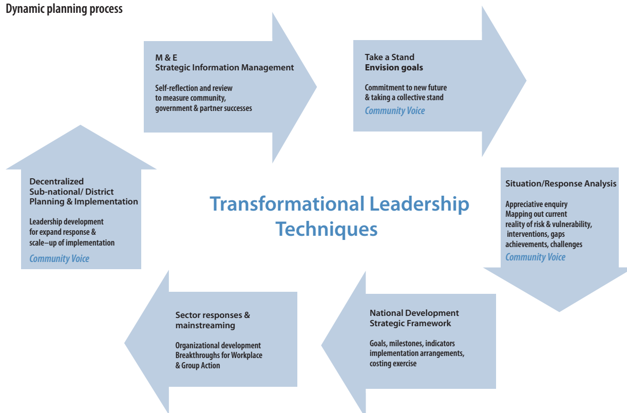
Fig 2. Dynamic planning process

The scheme below provides a schematic representation of an integrated, multi-sectoral, multi-level planning and implementation process. It illustrates the possible use of transformational leadership techniques at all stages of the cycle. The district or sub-national process represents the point where communities will most commonly interface with the local governance system and as such is where the practical integration and translation of development goals occurs. This decentralized level is also where communities can effectively demand better services and support structures.