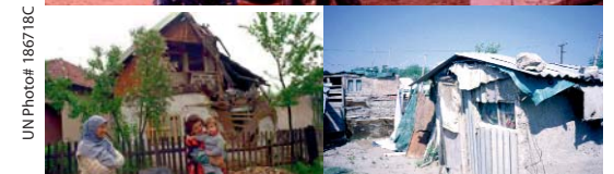
UN Photo# 186718C