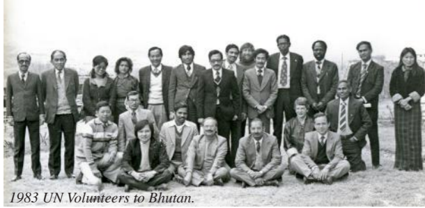
1983 UN Volunteers to Bhutan.