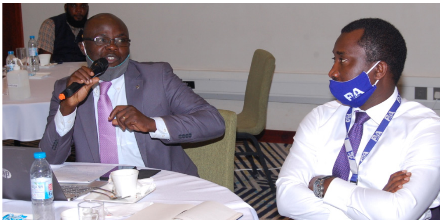
Government officials at a CoST Uganda workshop.