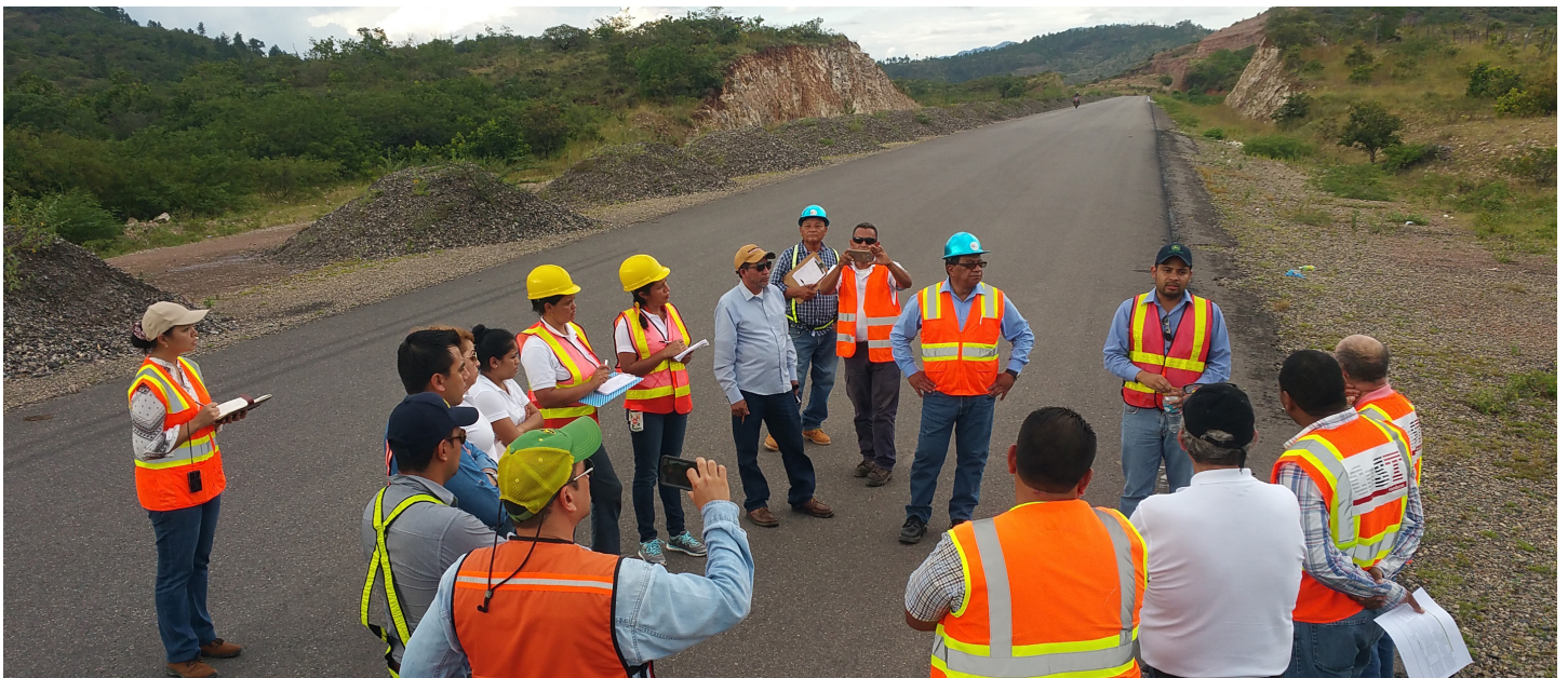
A road project site visit in Honduras.

The lengthy process was necessary to ensure that there was a robust approach that stakeholders can have confidence in. In due course, the methodology and indices will be updated to reflect the additional experience and lessons gained from its global application.