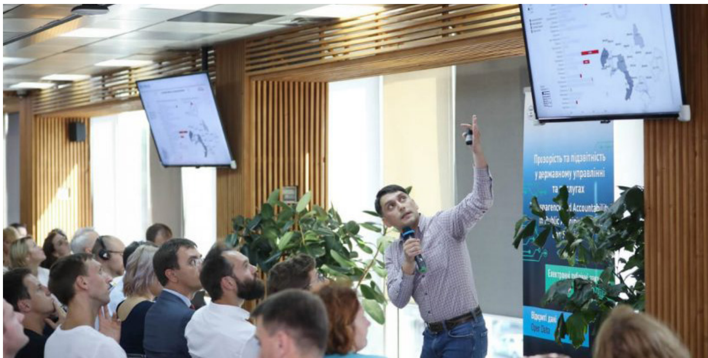
CoST Ukraine showcases its innovative tools.

Dimension 4 assesses the amount of data and information disclosed by the procuring entities according to the CoST Infrastructure Data Standard or the OC4IDS and its indicators are measured through desktop research. These indicators require two or three evaluators, as in dimension 1. The quality of the collected data comes from the same method, where a single observation will always be obtained through independent evaluation by two different people.