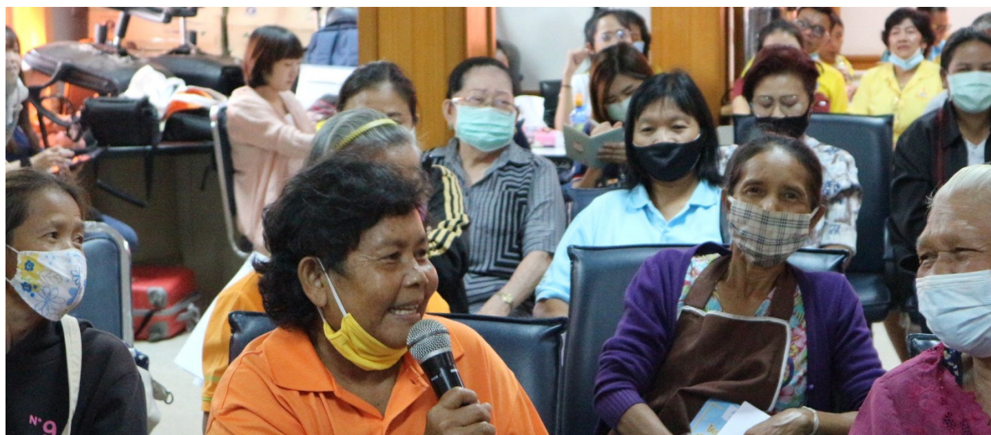
Civic engagement facilitated by CoST Thailand.

After the presentation and publication of the ITI results, it is normal that procuring entities and other stakeholders raise any questions or concerns they may have, ask for follow-up meetings and, in some cases, request training or other forms of support. The organisation(s) leading the ITI will need to have the capacity to respond to these needs.